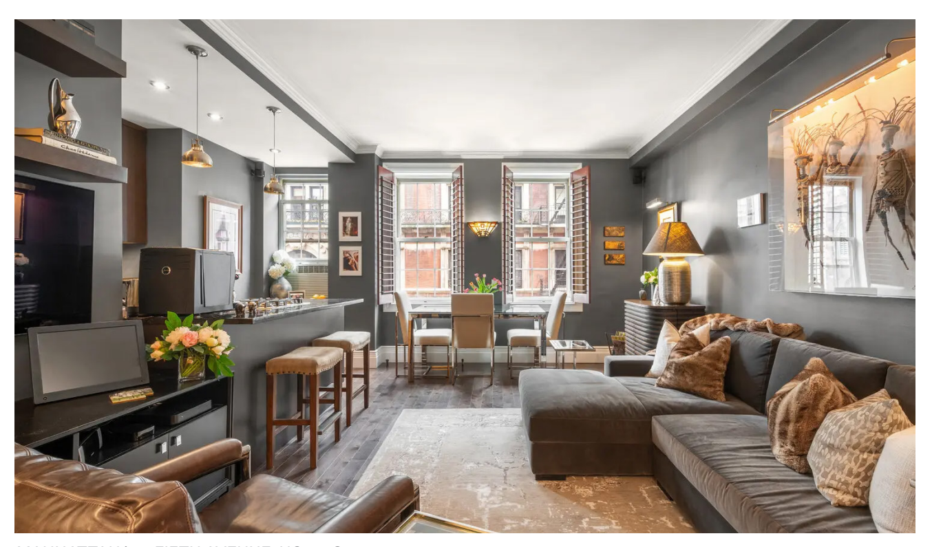
MANHATTAN | 41 FIFTH AVENUE, NO. 10C