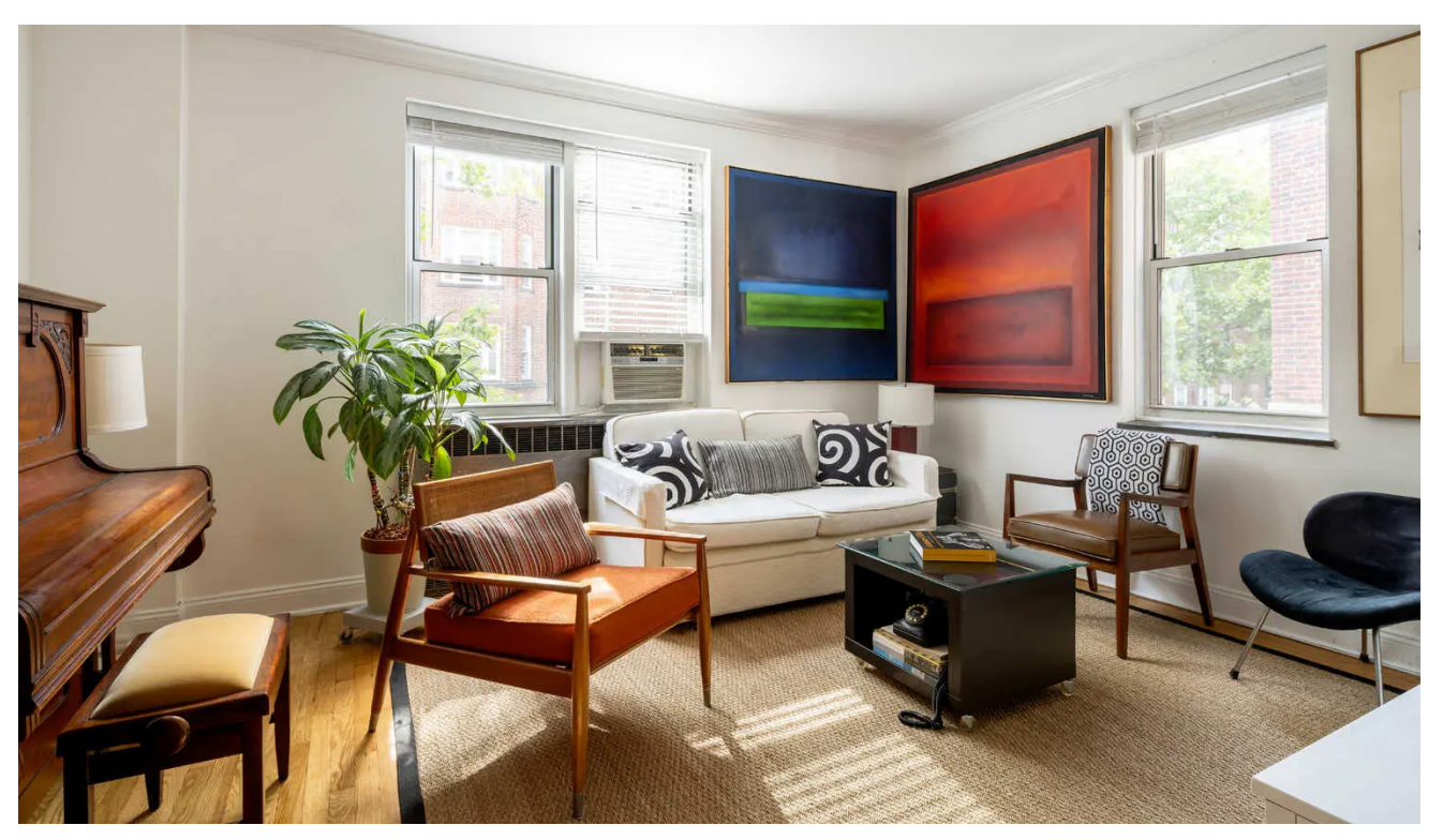
QUEENS | 35-21 79TH STREET, NO. 2P