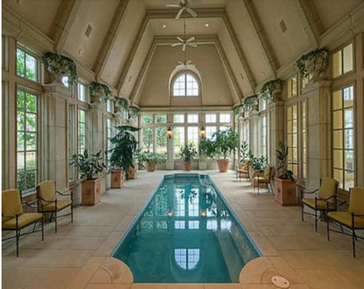
This Hickory Creek, TX home was listed at $35 million