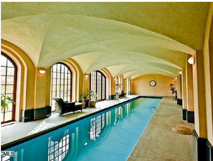
This Greenwich, CT home was listed at $15.9 million

Notable: Not only does this 26,000-sq ft Mediterranean manor home have its own private theater and elaborate wine-tasting room, but it also boasts an elegant lap pool under a Tuscan-yellow arched ceiling.