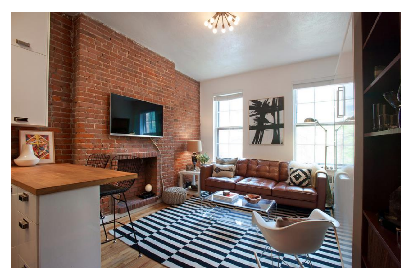
PROS A brick wall and a decorative fireplace add charm to this sunny unit. The kitchen is nicely renovated. A staircase leads to a closet as well as a roof deck that is shared with an adjacent unit.