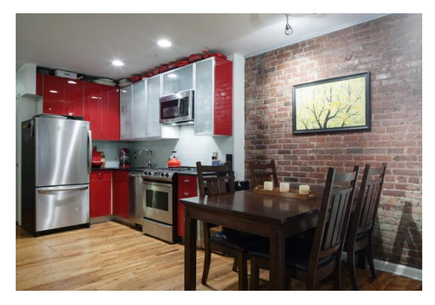
PROS The apartment, which is less than two blocks from Central Park, has brick walls, wood floors and a renovated kitchen.