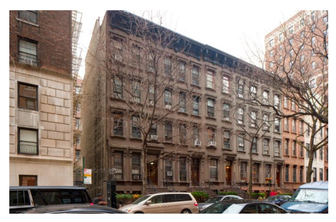
Upper West Side Co-op • $979,000 • MANHATTAN • 171 West 73rd Street, No. 2

A two-bedroom, two-bath duplex with a washer-dryer and a large patio shared with five neighboring units in a townhouse.