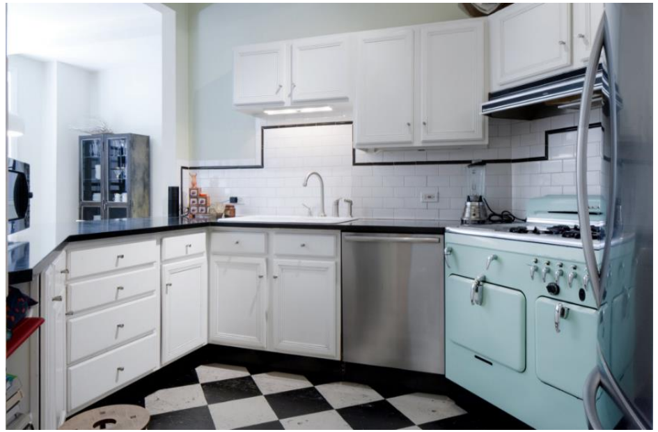
Gramercy Area Co-op • $1,995,000 • MANHATTAN • 102 East 22nd Street, #1EF PROS A long foyer leads to a spacious living room with an adjacent dining area. A kitchen pass-through lets in light and connects the space to the dining area. A roomy master bedroom suite has a double shower with two shower heads. There are high beamed ceilings throughout.