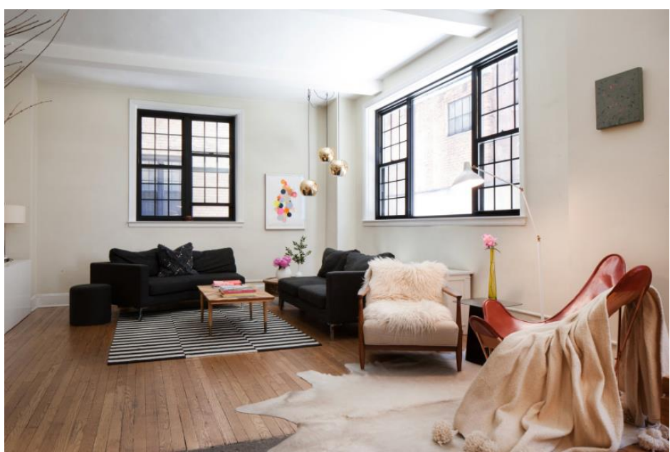
Gramercy Area Co-op • $1,995,000 • MANHATTAN • 102 East 22nd Street, #1EF MAINTENANCE $1,976 a month