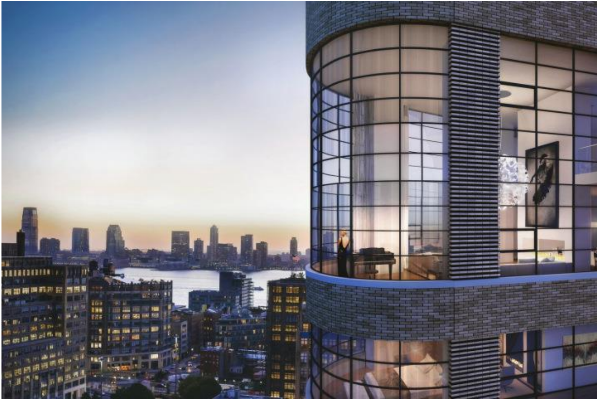
Sleek 10 Sullivan St. is among the showiest of SoHo's new luxury condo developments.

If you thought an apartment in a spiffy new building within heavily landmarked SoHo was unattainable these days, think again.