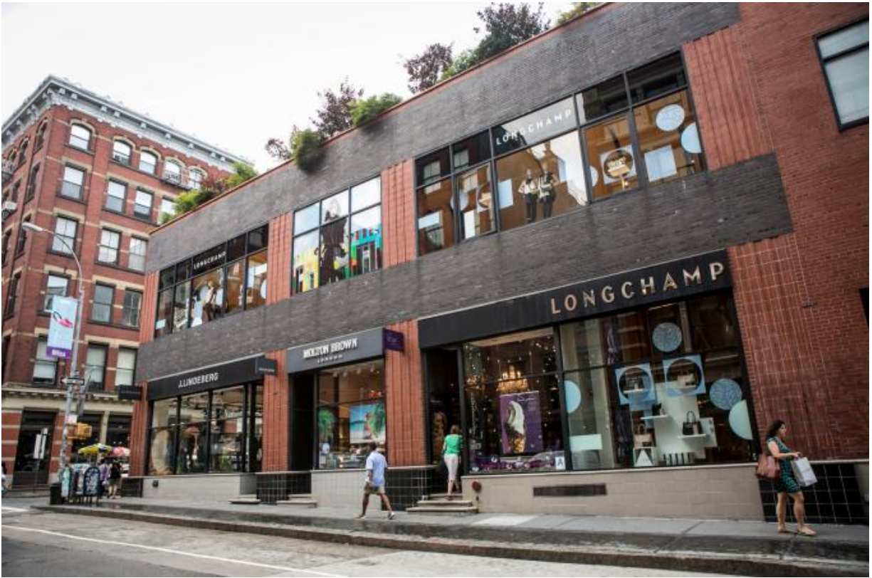
Chic-y charmer Spring Street, between Broadway and West Broadway.