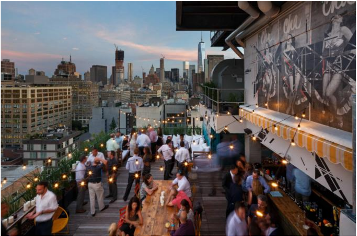
Hotel Hugo's al fresco social scene.

Hotel Hugo opened last year bearing an Italian eatery and a rooftop bar — great additions to the area, which sources say still lacks commercial options.