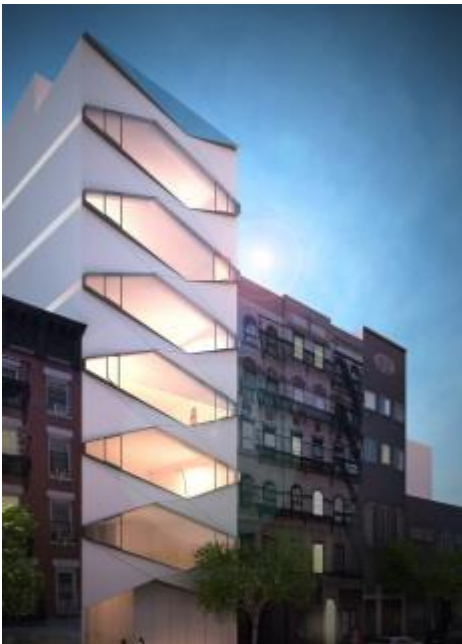
Karim Rashid designed this cool condo at 30 Thompson.