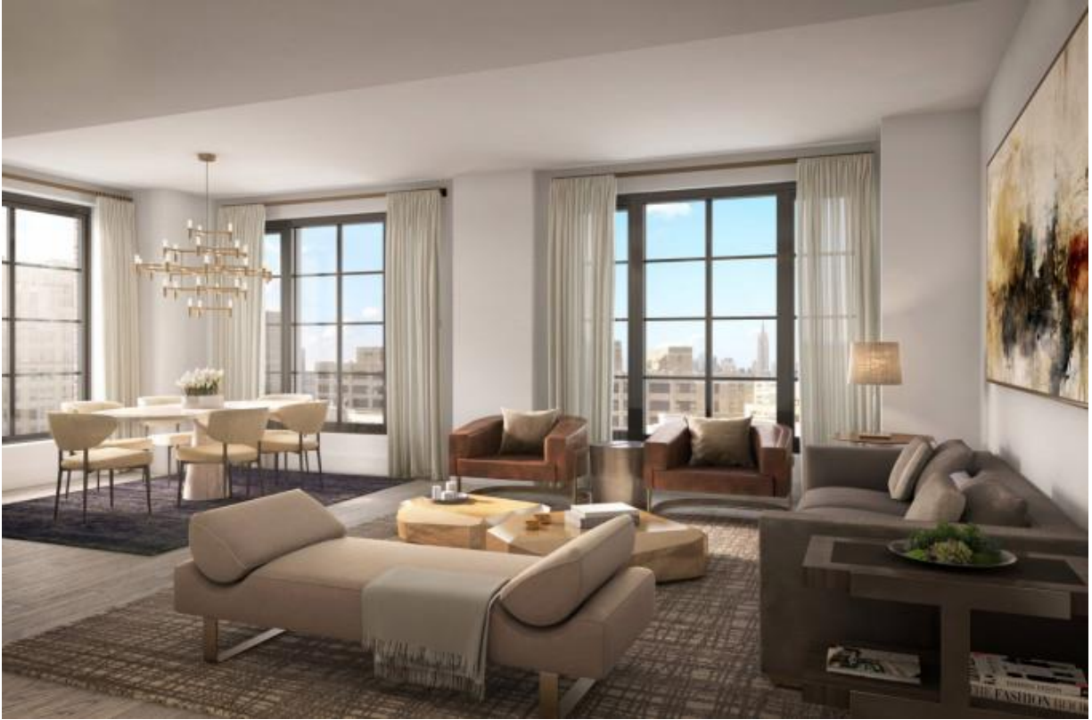
A luxe living room at 70 Charlton on SoHo's western edge.