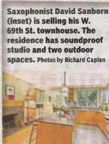
Saxophonist David Sanborn (inset) is selling his W. 69th St. townhouse. The residence has soundproof studio and two outdoor spaces.