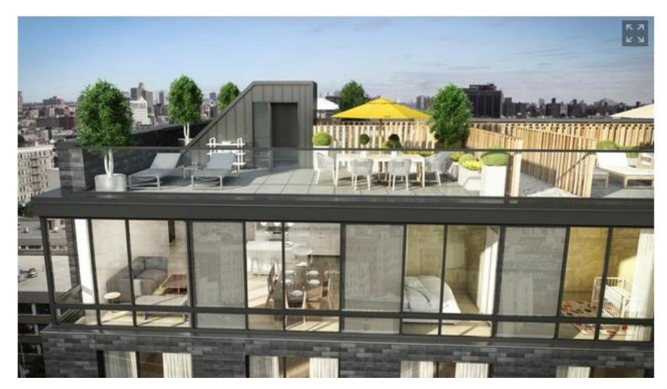
The penthouse at the Adeline is for those with slightly looser purse strings