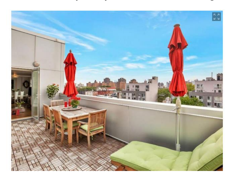
This penthouse in East Harlem comes with a terrace -- and a view

The high life isn't only for Rupert Murdoch -- Downtown, East Harlem, Murray Hill and Gramercy have penthouses in the $1M range