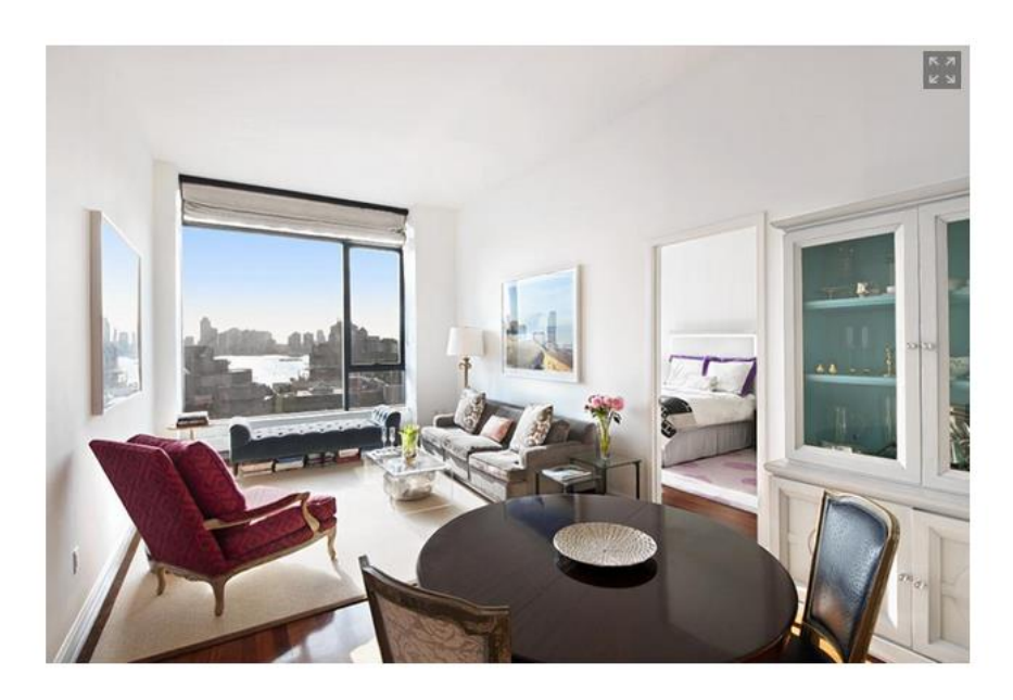
The 255 Hudson St. penthouse boasts 13-foot ceilings and floor-to-ceiling windows.