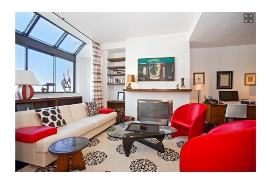
Angled glass ceiling windows amp up the view at 280 Park Ave, S.