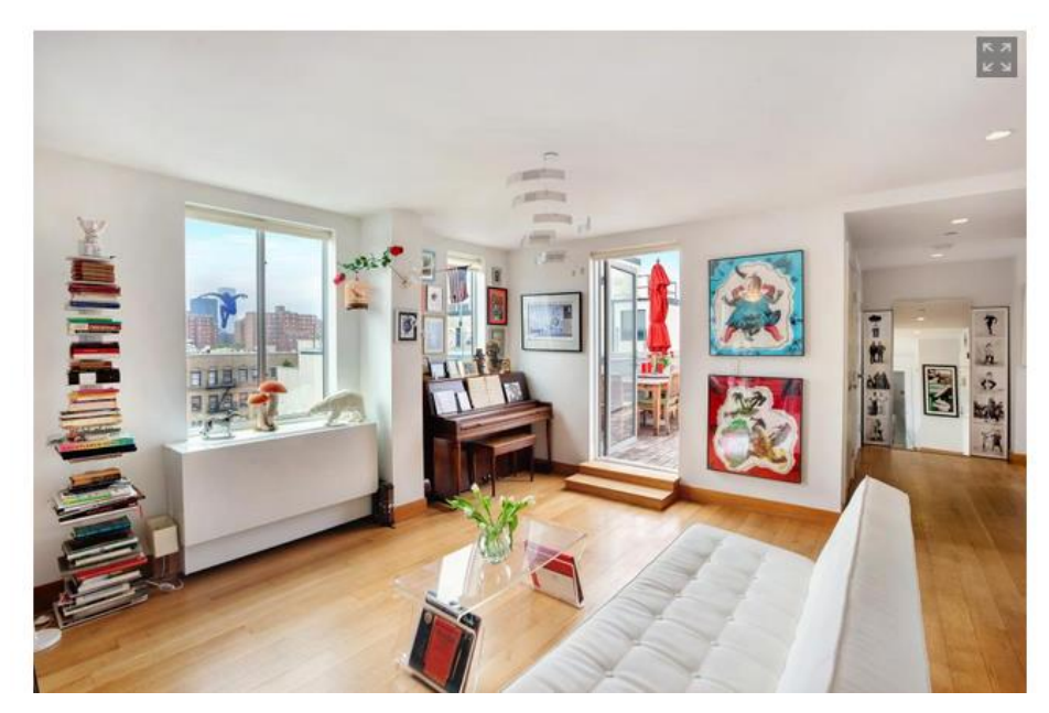
This Harlem penthouse is way more affordable than similar Manhattan pads

Here are five New York City penthouses where you can live like an oil baron without a matching bank balance: