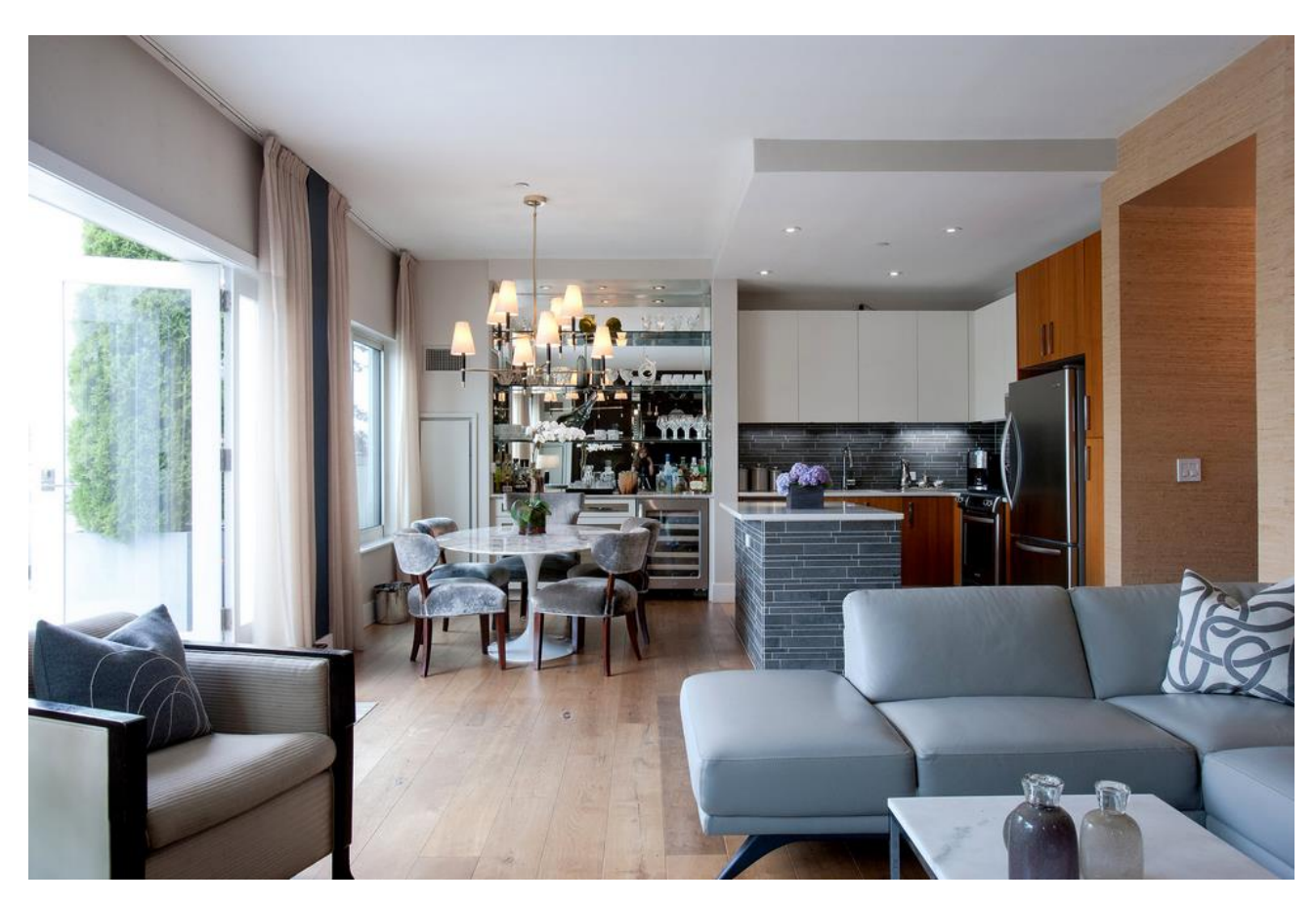
COMMON CHARGES $1,344 a month; taxes: none through 2025 because of an abatement.