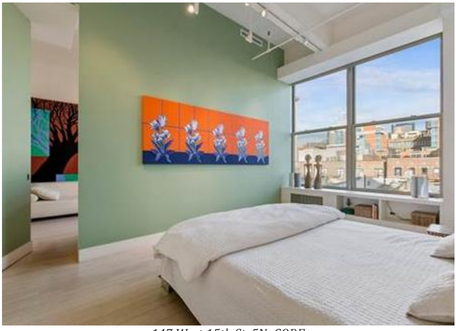
147 West 15th St, 5N; CORE

<u>147 West 15th St, 5N</u> – Currently listed for $3,750,000 this 2-bedroom, 2.5 bath loft is located on a prime Chelsea block. With incredible modern accents and soothing colorways, this apartment is serene getaway.