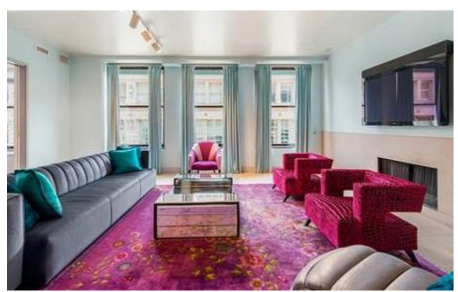
32 West 18th Street, 7A; CORE

32 West 18th St, 7A – Listed at $5,395,000, this 3-bedroom, 3-bath is located in Flatiron. The apartment was designed by world-renowned architect, Rafael de Cardenas and boasts a custom graphic mural in the dining area by muralist, James Conran.