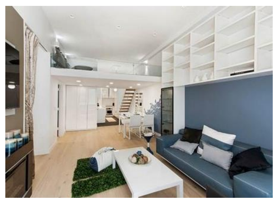
372 Fifth Avenue, 7A; CORE

372 Fifth Avenue, 7A – Listed at $1,250,000 this 1-bedroom, 1-bath offers all furniture and decoration, as pictured in the photos, in the asking price – all of which has never been used.