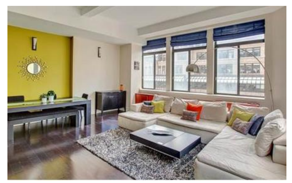
310 East 46th St, 16V; CORE

\underline{395} South 2nd St, \underline{1} – This 2-bedroom, 3-bath duplex Brooklyn condo is currently listed at $995,000 and features a private garden, over 1,307 square feet and a washer/dryer.