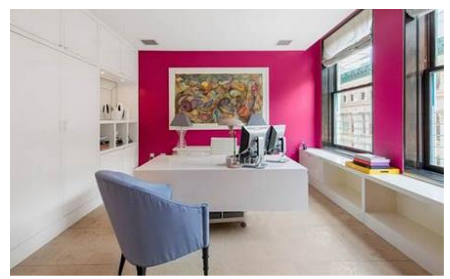
32 West 18th Street, 7A; CORE

<u>119 East 10th Street, GRDN</u> – Formally owned by Chloë Sevigny, this cottage-like 1-bedroom, 2-bath has been meticulously renovated and features a private outdoor patio.