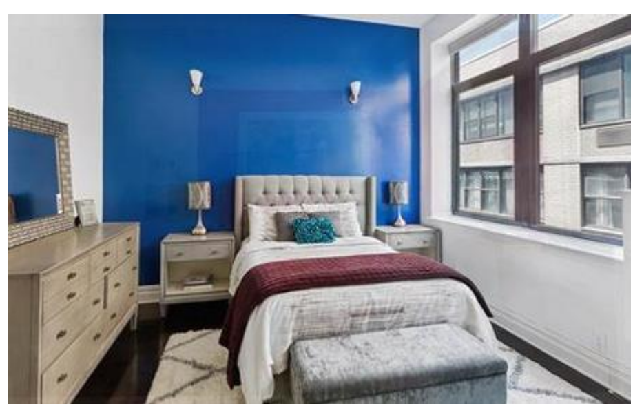
310 East 46th St, 16V; CORE

<u>310 East 46th St, 16V</u> – Listed under $1 million at $999,000, this Midtown East 2-bedroom, 1-bath boasts a dramatic, oversized living room with beamed ceilings and sunny southwestern exposures.