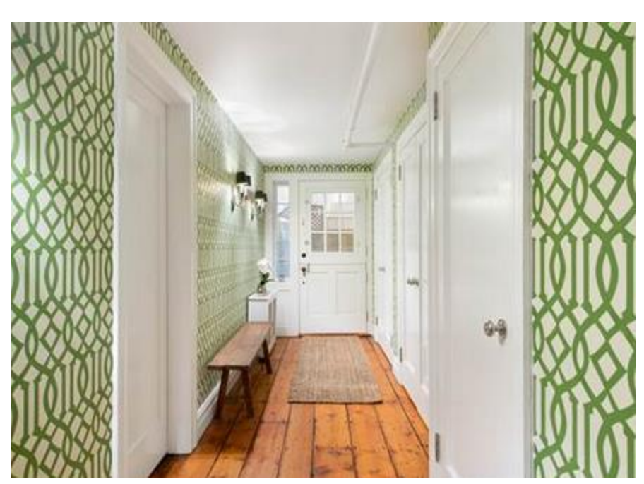
119 East 10th Street, GRDN; CORE

<u>119 East 10th Street, GRDN</u> – Formally owned by Chloë Sevigny, this cottage-like 1-bedroom, 2-bath has been meticulously renovated and features a private outdoor patio.