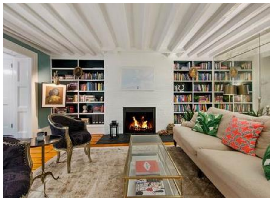
119 East 10th Street, GRDN; CORE

<u>147 West 15th St, 5N</u> – Currently listed for $3,750,000 this 2-bedroom, 2.5 bath loft is located on a prime Chelsea block. With incredible modern accents and soothing colorways, this apartment is serene getaway.