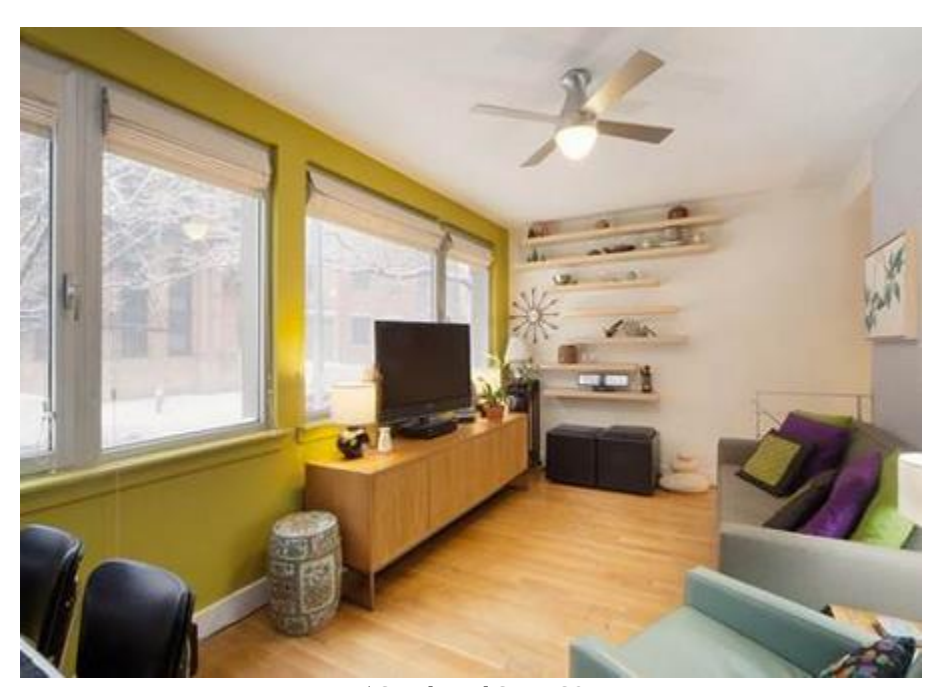
395 South 2nd St, 1; CORE

\underline{395} South 2nd St, \underline{1} – This 2-bedroom, 3-bath duplex Brooklyn condo is currently listed at $995,000 and features a private garden, over 1,307 square feet and a washer/dryer.