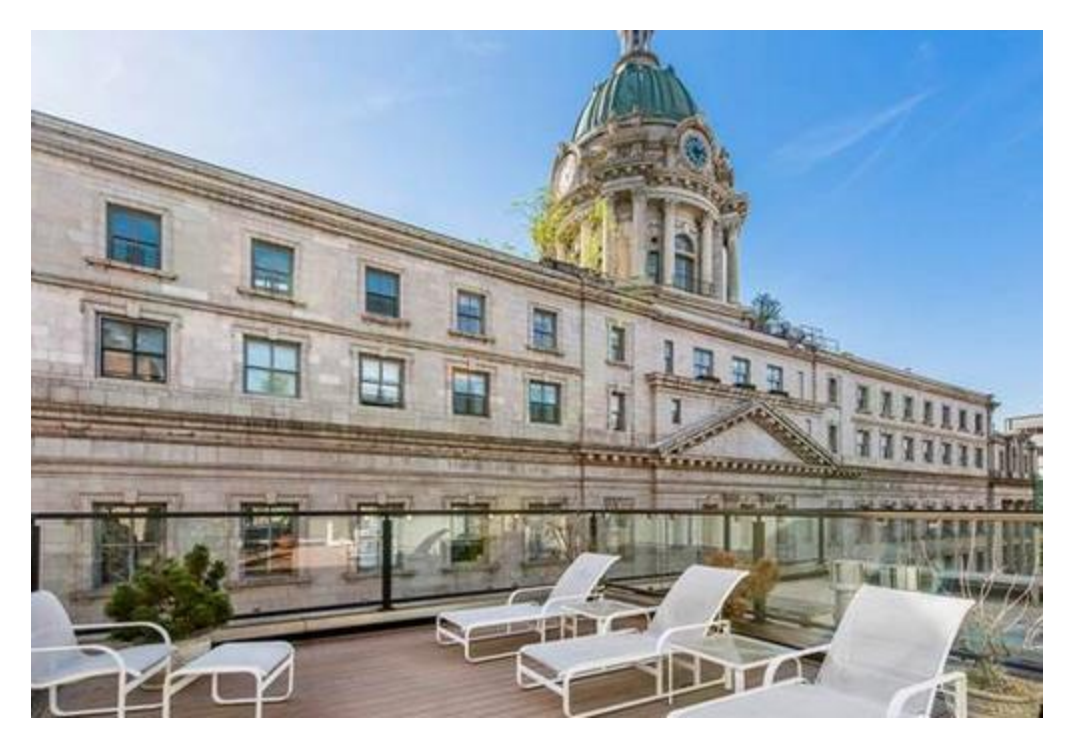
Old Police Headquarters