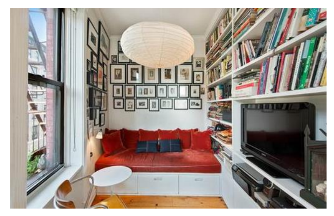
Gallery Walls Steel the Show

374 Broome Street, PHS: Currently listed for $8,995,000 this 3-bedroom, 3-bath penthouse at the old Brewster Carriage House is exactly where Soho, Chinatown, Little Italy, the lower East Side and Nolita intersect. Originally built in 1856, the old Brewster & Co. carriage factory resurrected an American industry. Restored in 2010, the carriage house now houses nine units yet still embodies original detailing throughout—such as the Queen Anne lobby desk, dating back to the 1700s.