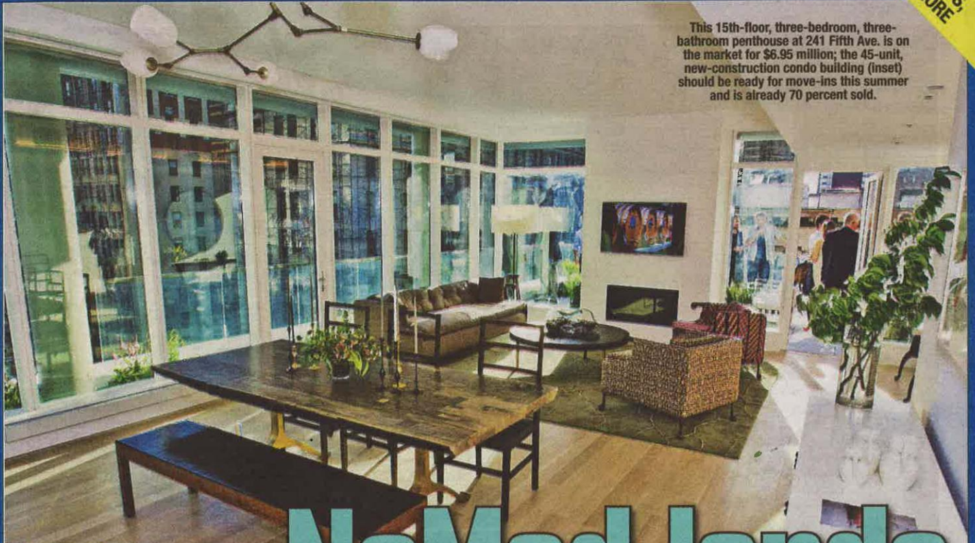
This 15th-floor, three-bedroom, three-bathroom penthouse at 241 Fifth Ave. is on the market for $6.95 million; the 45-unit, new-construction condo building (inset) should be ready for move-ins this summer and is already 70 percent sold.

WINTER SHELTER OUR CALENDAR OF EVENTS, PHOTO GALLERIES & MORE