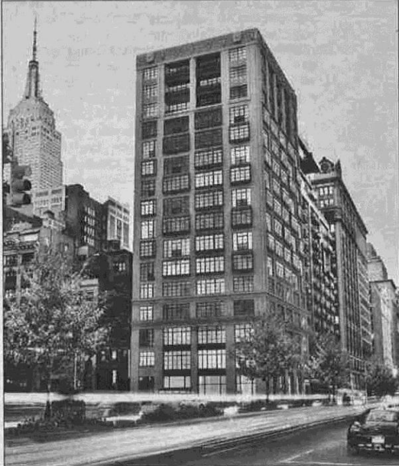
DUTCH TREAT: Park Avenue South is getting Dutch-designed Huys, a new 58-unit condo going for about $2,100 per foot.