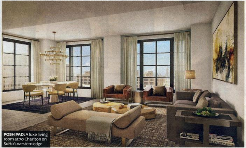
POSH PAD: A luxe living room at 70 Charlton on SoHo's western edge.