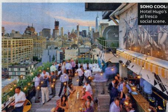
SOHO COOL: Hotel Hugo's al fresco social scene.