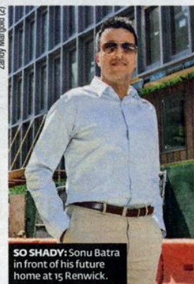
Zandy Wang/Red (2)