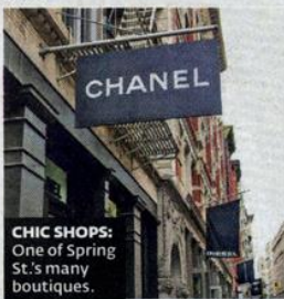
CHIC SHOPS: One of Spring St.'s many boutiques.

Though some industry sources consider this former manufacturing district its own neighborhood (sources say NoCa, or North of Canal, is an emerging name), others insist it's simply a western swath of SoHo.