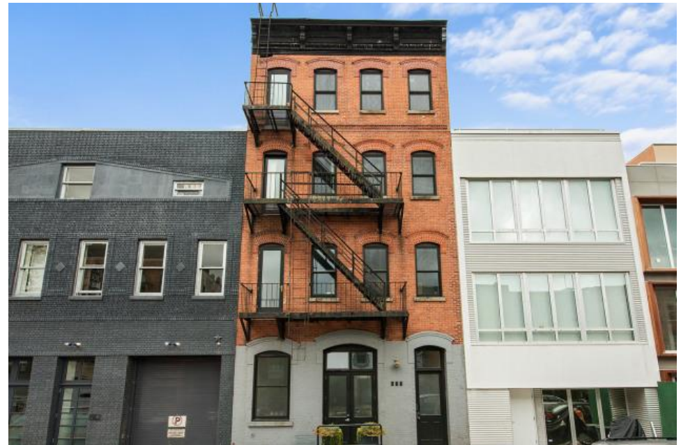
The building once housed a brush-and-ink factory.

The master bedroom had been configured as an artist's studio, with an array of worktables, fabric rolls and small images attached to walls. We peeked through a window looking out onto Carroll Street, across which stands a dark brick building with graffitied garage doors. Outside, a man in mechanic's garb wearing forearm tattoos buffed a late model BMW to high sheen.