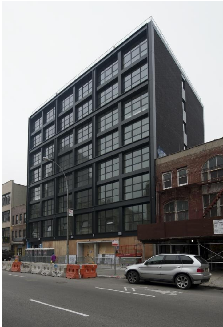
250 Bowery on the Lower East Side