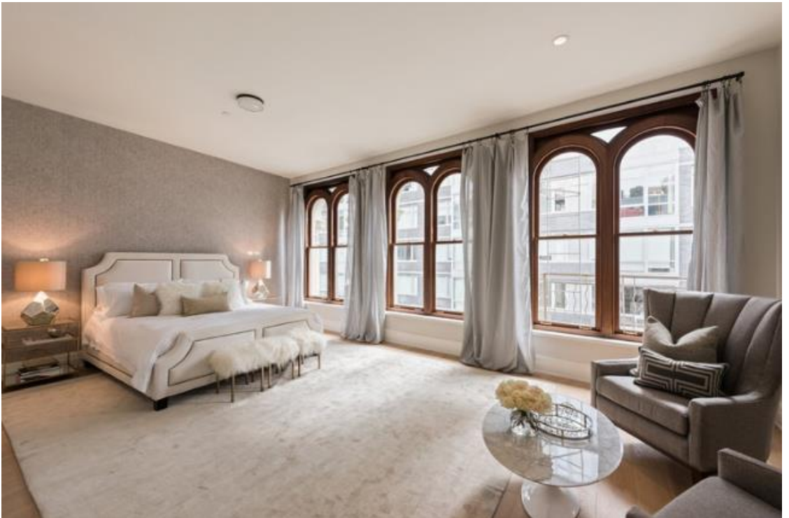
LAYERING A VARIETY OF TEXTURES THROUGHOUT THE BEDSCAPE ELEVATES THE USE OF NATURAL, NEUTRAL TONES; CREATING A CALM VIBE FOR THE END OF THE DAY AND A FRESH START IN THE MORNING.

Layering a variety of textures throughout the bedscape elevates the use of natural, neutral tones; creating a calm vibe for the end of the day and a fresh start in the morning.