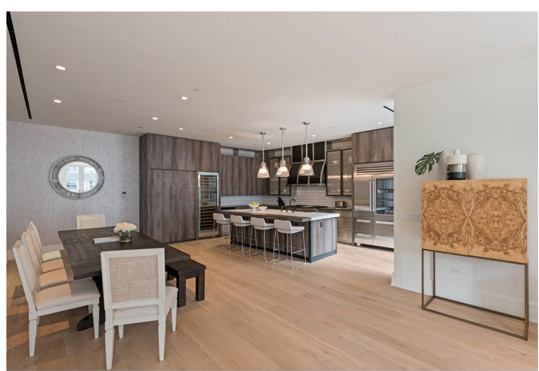
YOU ALWAYS WANT A KITCHEN WITH THE CAPACITY TO ENTERTAIN. HERE THERE ARE A VARIETY OF DIFFERENT SEATING OPTIONS FOR ALL WHO ENTER, WITH AN OPEN PATH OF CONVERSATION WHETHER ONE IS COOKING OR ENJOYING THE FOOD. DIFFERENT ELEMENTS OF WOOD FROM CABINETRY, TO TABLE AND THE ACCESSORY STORAGE ACCENTUATE THE BRIGHT HARDWOOD FLOORING – PRODUCING A COMFORTABLE, APPETIZING TONE IN A MODERN SPACE.

"For me, New York is everything. I'll walk down the street for half a block and I'm immediately rejuvenated and inspired," expressed Spellman. "The electric energy is my fuel!"