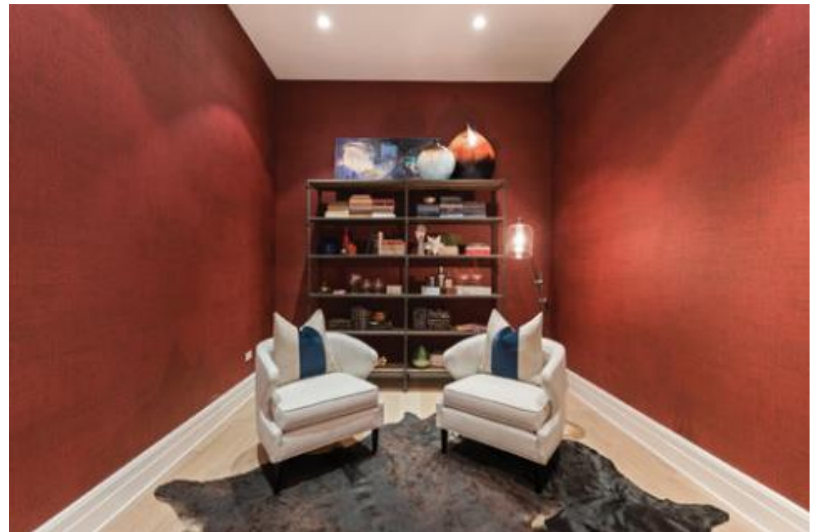
TOO OFTEN, PEOPLE SAVE DARING COLORS LIKE RED ONLY FOR ONE ACCENT WALL. HERE THE ENTIRE ROOM IS A BOLD, WARM RED AND IT FITS THE SPACE WELL – COMMUNICATING A LUXURIOUS, ALLURING SENSATION TO ALL WHO ENTER.