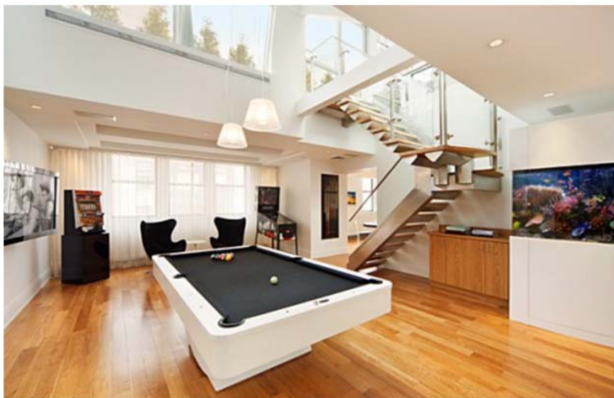
Gambling, games and tropical gills: What else does a guy need?