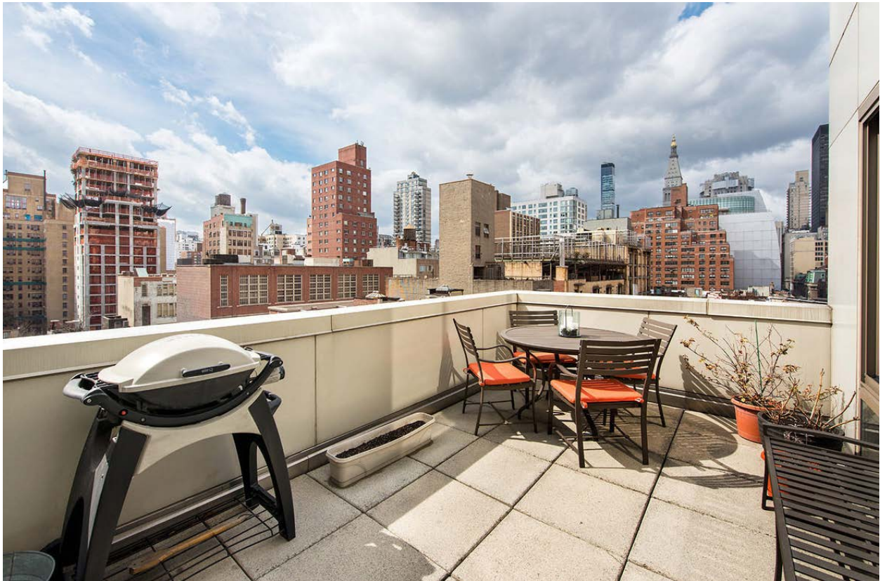
242 East 25 th Street, Apartment 10B

Welcome to a semi-regular feature, Price Points, in which we pick a relatively low asking price and a type of apartment, then scour StreetEasy to find the best available options around the city. Today's task: apartments with private outdoor space for around $1 million.