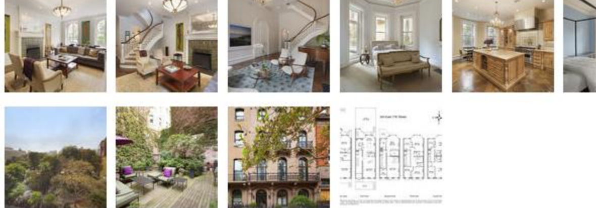
This 19th-century home faces picturesque Stuyvesant Square Park (which may explain its $15 million price tag), and has five bedrooms over nearly 6,500 square feet of space. It also has five fireplaces, including one with beautiful Art Deco ornamentation that's in the dining room, near a winding staircase. And just in case the park being nearby isn't enough for you, there's a garden off the first floor.