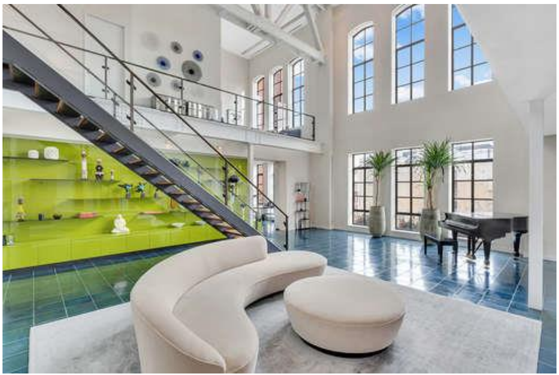
The central walnut staircase connect the multilevel unit; Image via Core

Bordering Seventh Avenue & Eighth Avenue, <u>213 West 23rd Street</u> includes an intimate mix of 12 apartments, over 9 floors —and as we've mentioned— the landmarked structure