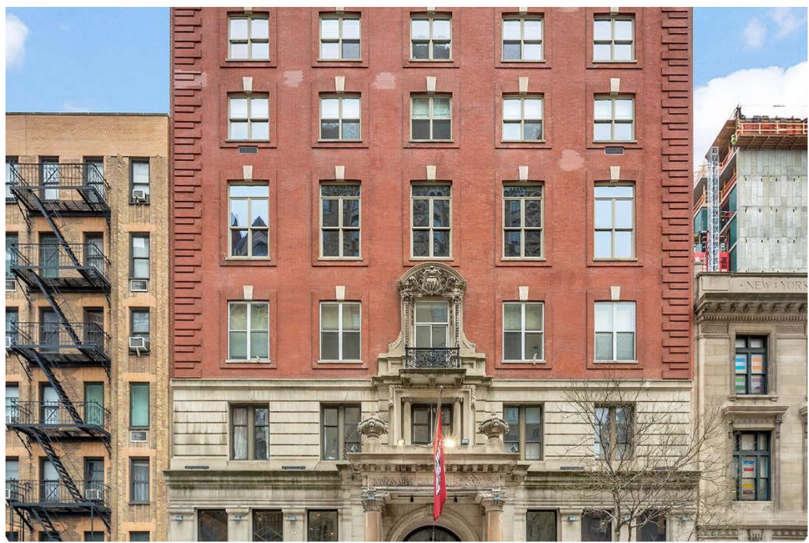
213 West 23rd's Beaux Arts facade

The boutique elevator building is pet-friendly, has a professional part-time staff, excellent access to public transportation, and a central <u>Chelsea</u> location that affords residents with incredible views, fine dining, shopping, and taking part of the area's bustling art scene.