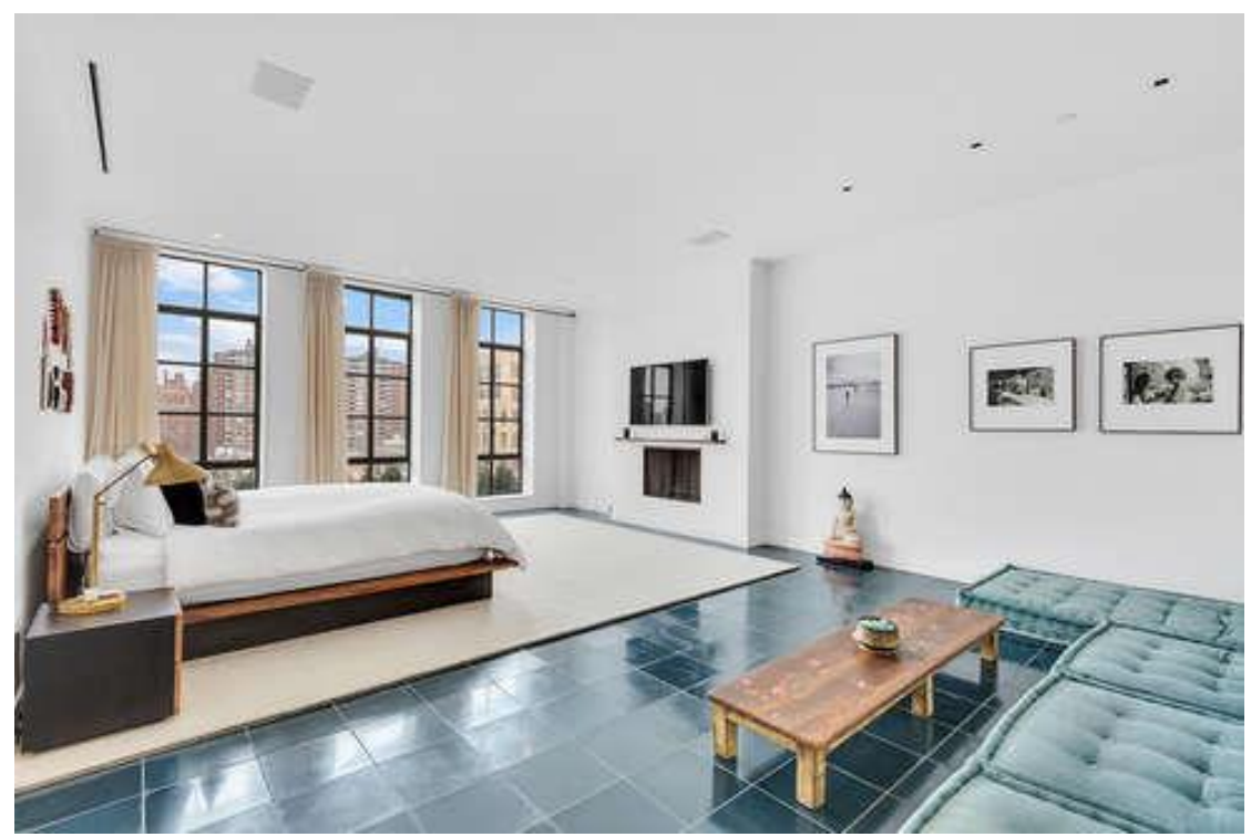
Master suite; Image via Core