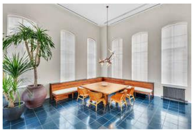
The adjacent dining area; Image via Core