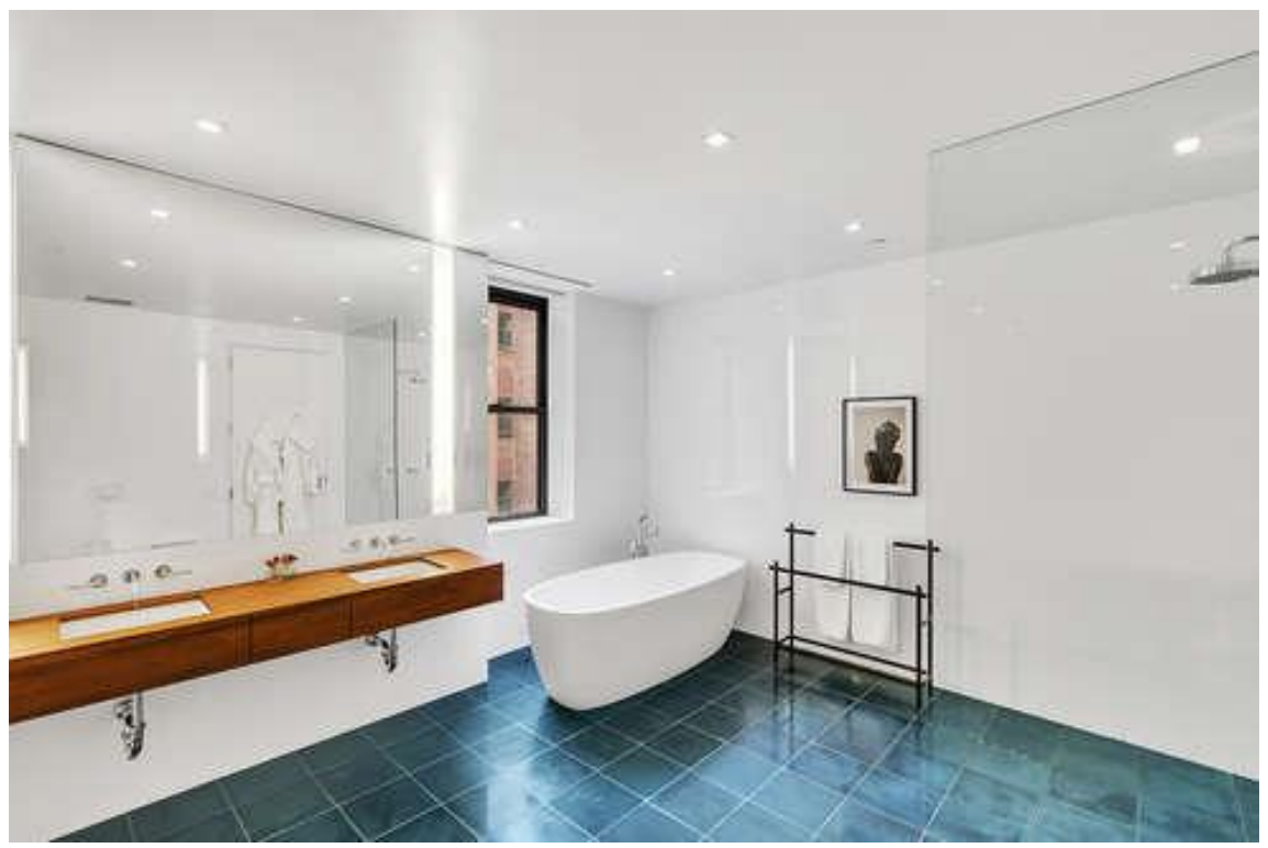
The 5-piece bathroom