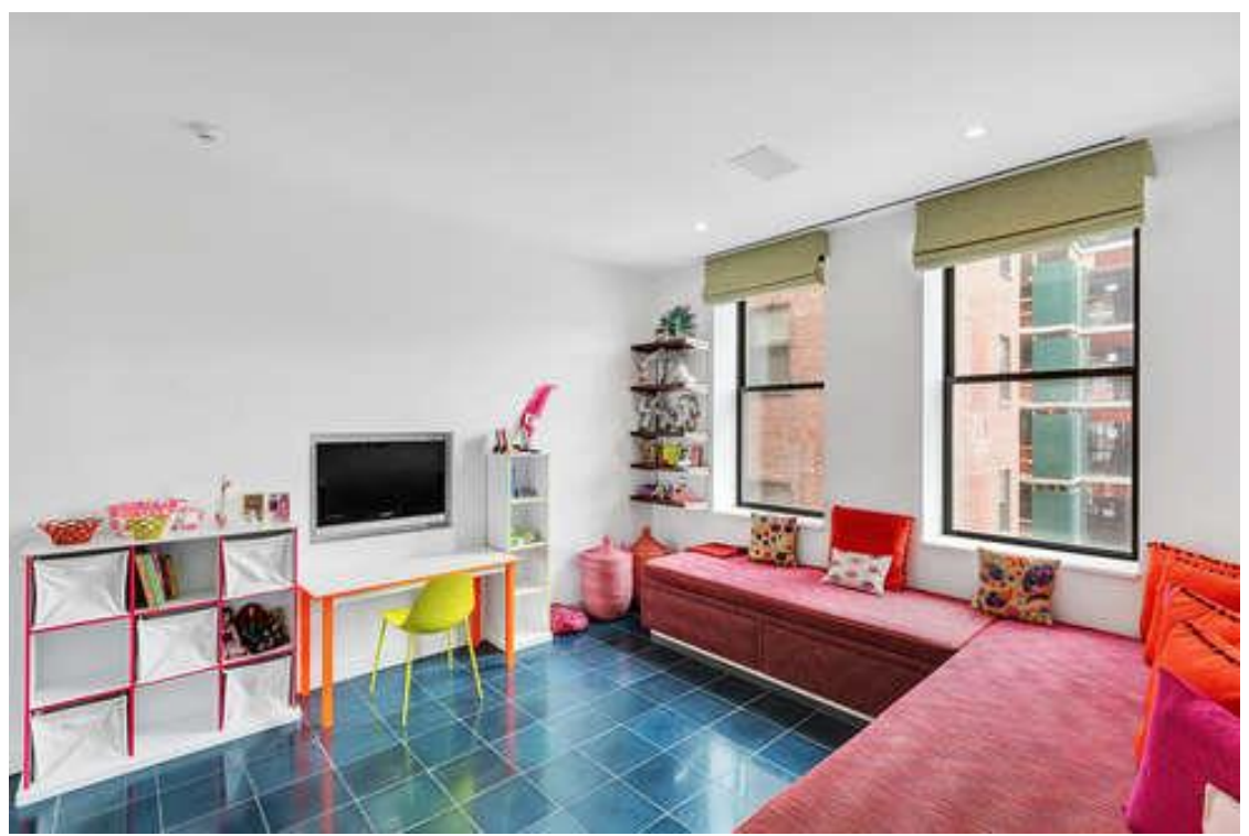
Second bedroom with great potential for customization