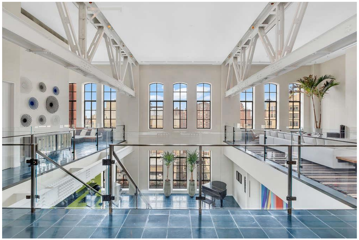
The sprawling duplex is back on the market! 213 West 23rd Street

A uniquely laid out <u>4-bedroom duplex</u> is back to the <u>Chelsea</u> market —only now it has been relisted at a discounted price. The stunning unit was initially listed at $14.5 million back in October 2016 but, as <u>CurbedNY</u> points out, didn't manage to land a buyer despite glowing accolades from The New York Times .