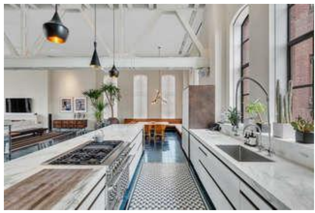
A closer look at the high-end kitchen