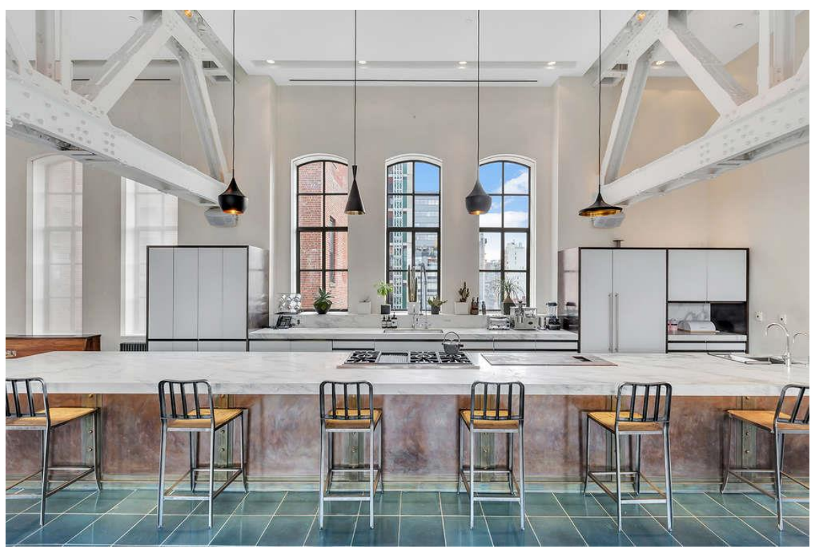
Open concept kitchen with an extra long marble island

The multilevel apartment sprawls to an unparalleled size of 7,000 square feet that is tiled with radiant-heated ceramic flooring throughout, and connecting the two stories is a stylish glass-enclosed walnut staircase. Another notable feature is the unit's automated Crestron heating/cooling systems, and the original steel beams that ornate the ceilings. These features, along with the two wood-burning fireplaces (one in the living room, another in the master bedroom), guarantee warm and comfy winters ahead!