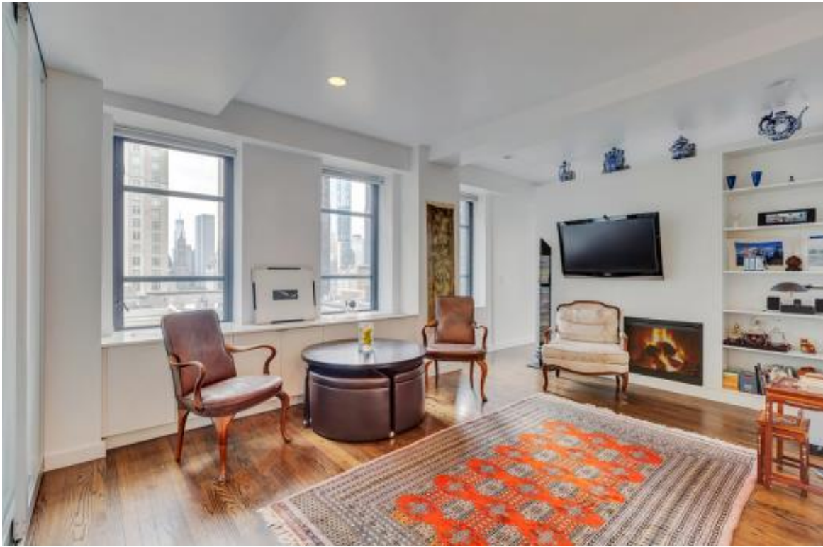
This bright, airy Lincoln Square two-bedroom has a cap rate of 4.48%. More information below.

Looking for an apartment in NYC is oddly similar to looking for love—you need to be willing to woo and be wooed, know how to beat out the competition, and of course, be prepared for rejection. But at least with apartment-hunting—unlike dating—there's an easy way to figure out whether or not pursuing a particular prospect is worth it.