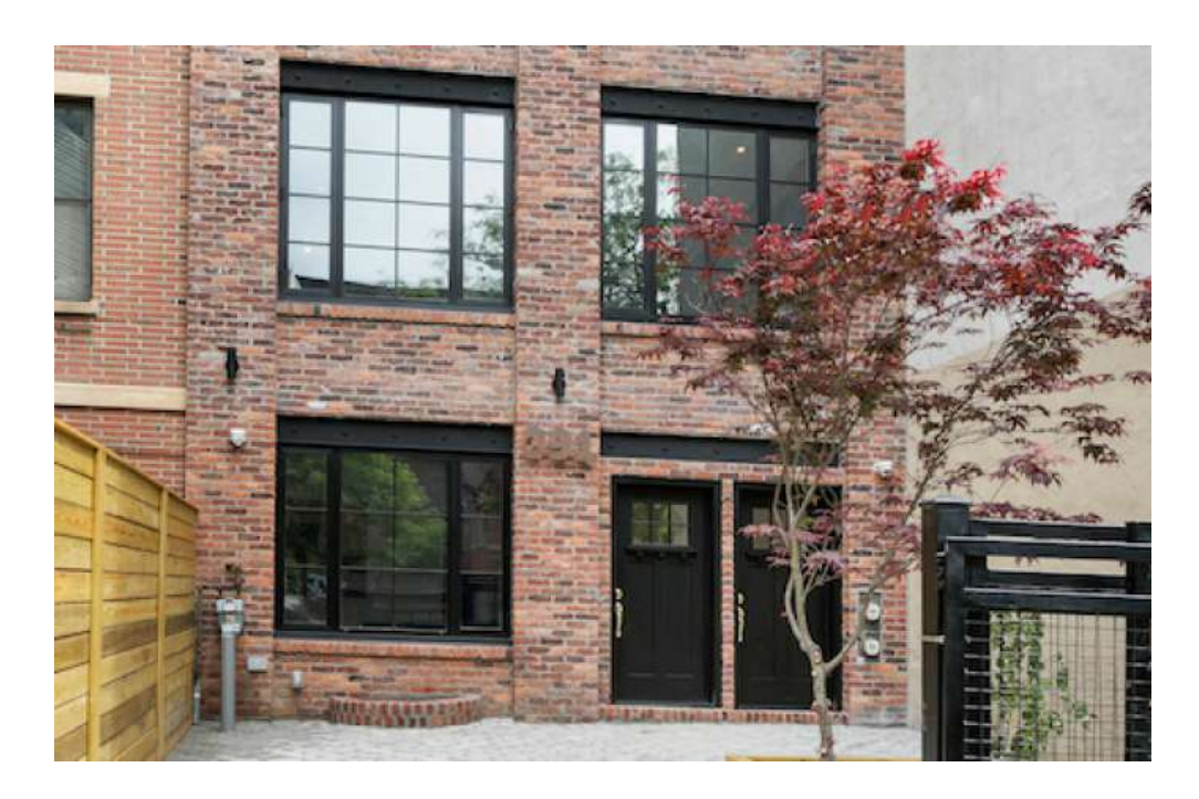
For $3.95 million, you can pick up this newly built, multi-family townhouse (with an owner's triplex and a smaller studio/guest suite) at 391 South 3rd Street in Williamsburg with a gated front courtyard—just beyond the front door—that doubles as a private parking space.