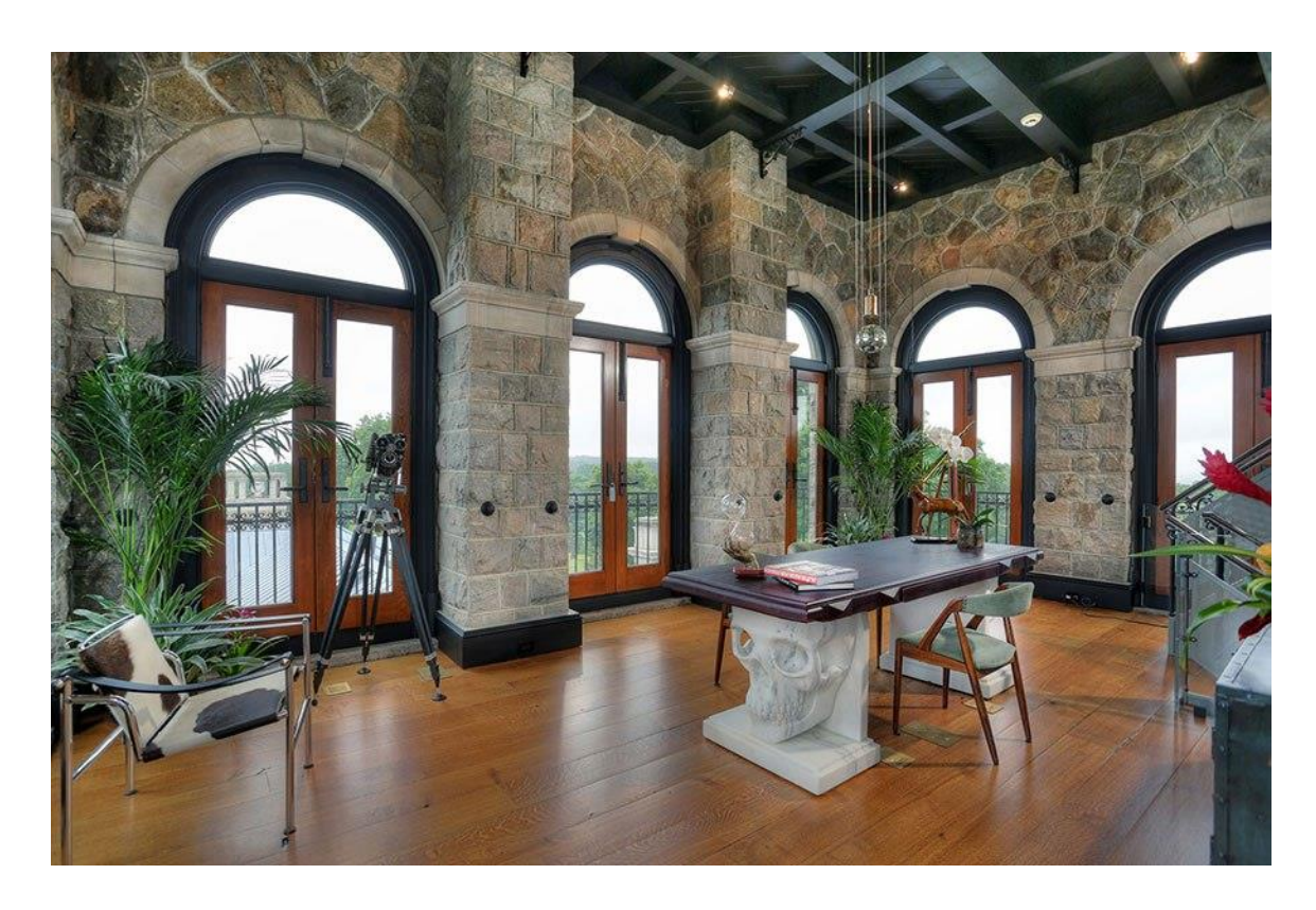
Beyond the stone façade, the interiors were constructed from fieldstone, wood, and terra-cotta, as seen in the study.