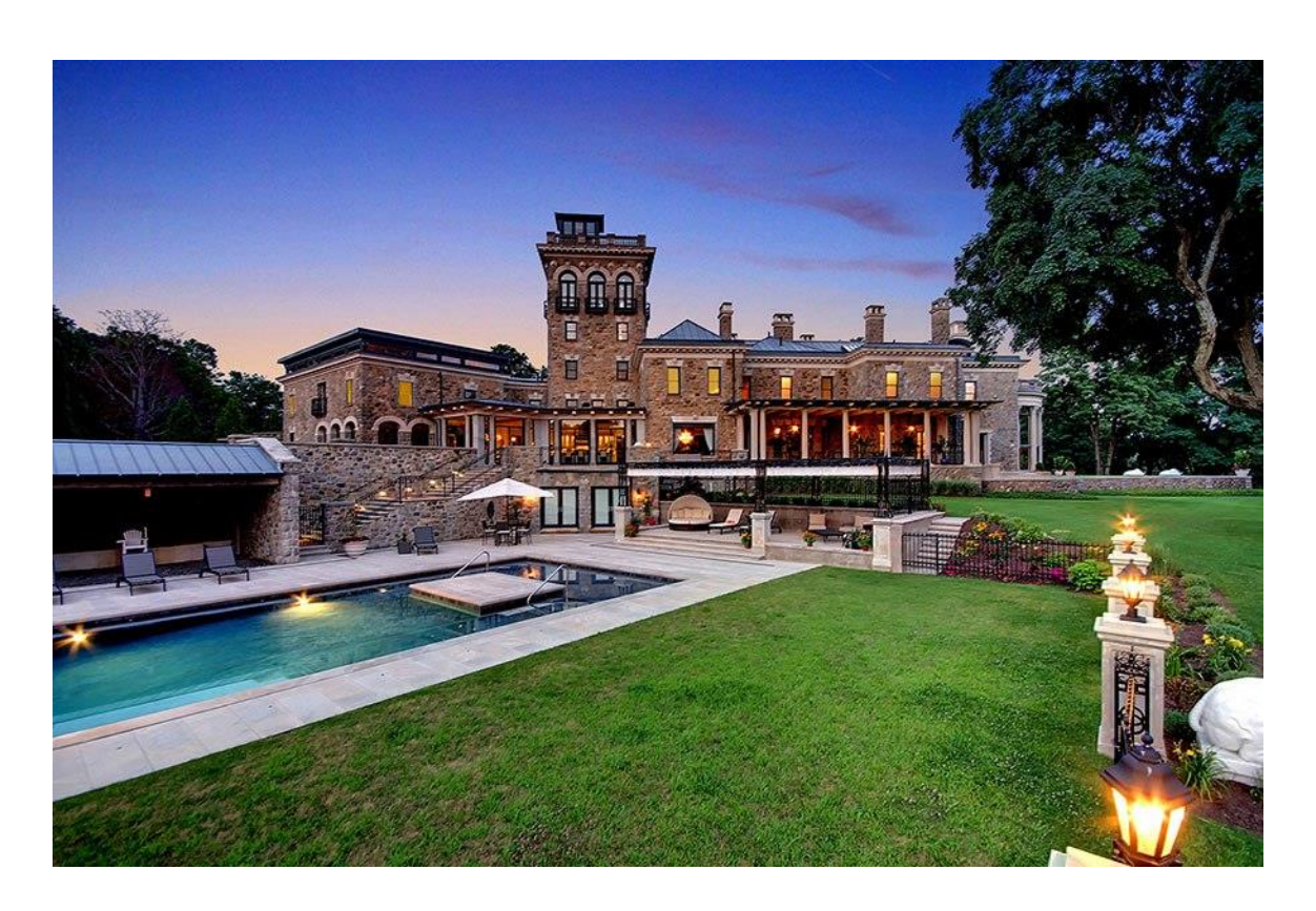
Nearly 32 acres of manicured grounds surround the home. Additionally, a separate carriage house makes for the perfect guest quarters.