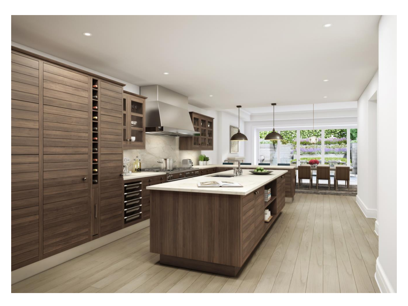
Clean lines define the chef's kitchen.