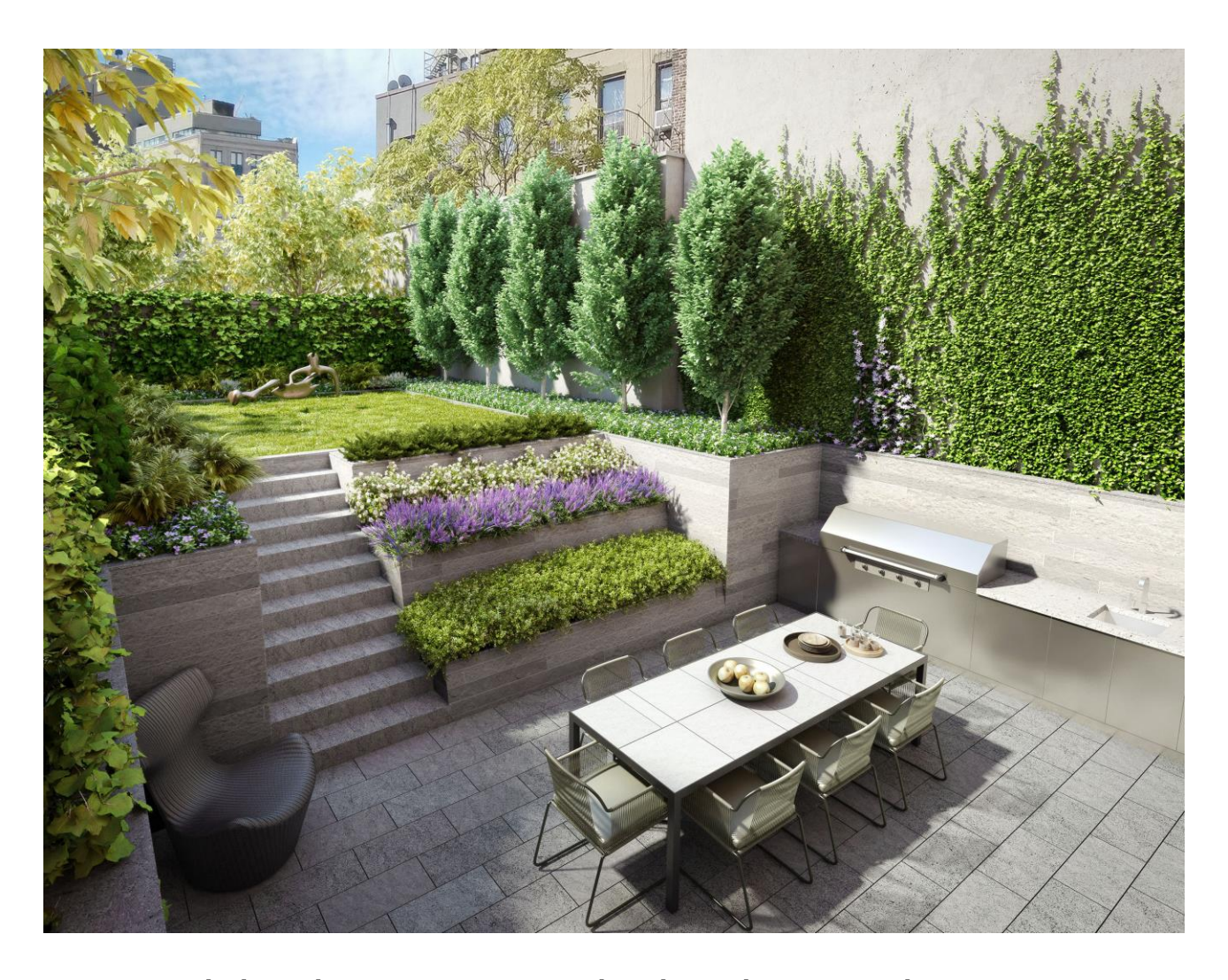
The home has a private manicured garden with a spacious dining area.