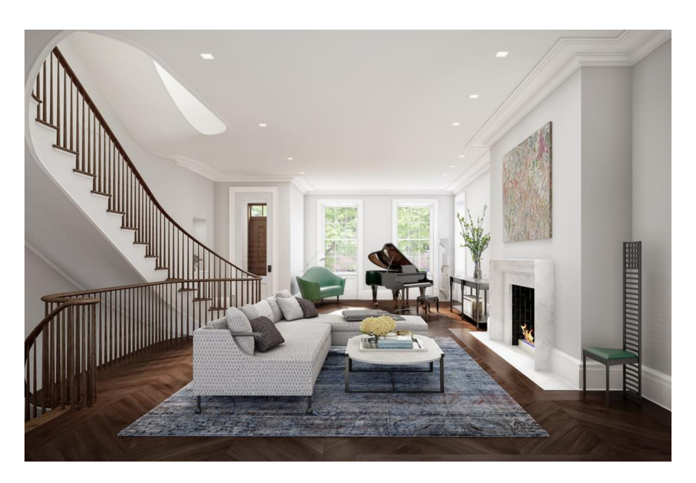
The elegant parlor level boasts herringbone wood flooring and a curved staircase.

Contact: Core, 212.612.9648; princeatmott.com