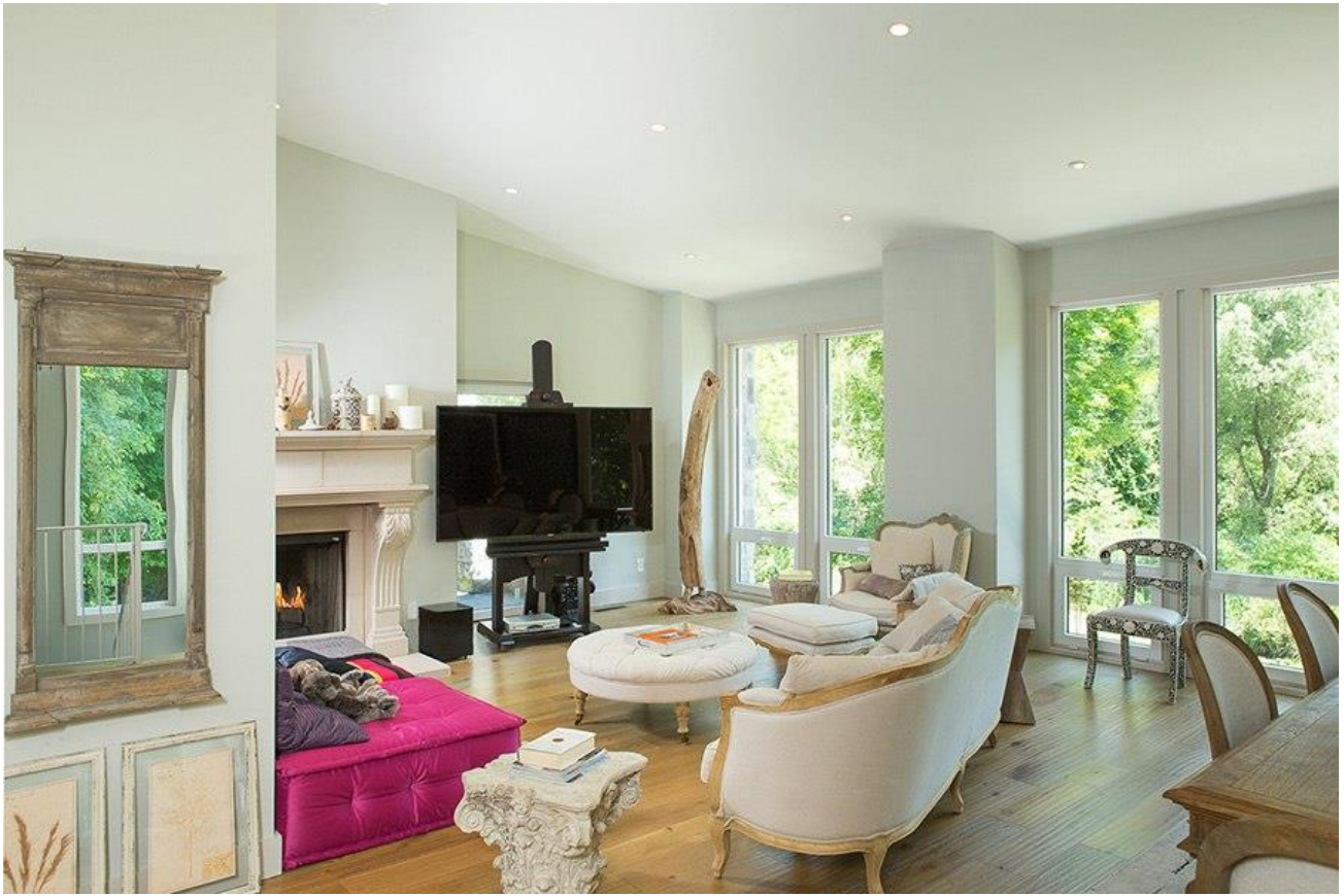
Floor-to-ceiling windows line the living and dining rooms.