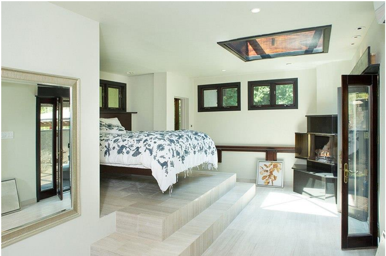
The master bedroom features a floating bed, a wood-burning fireplace, skylights, and a private balcony.