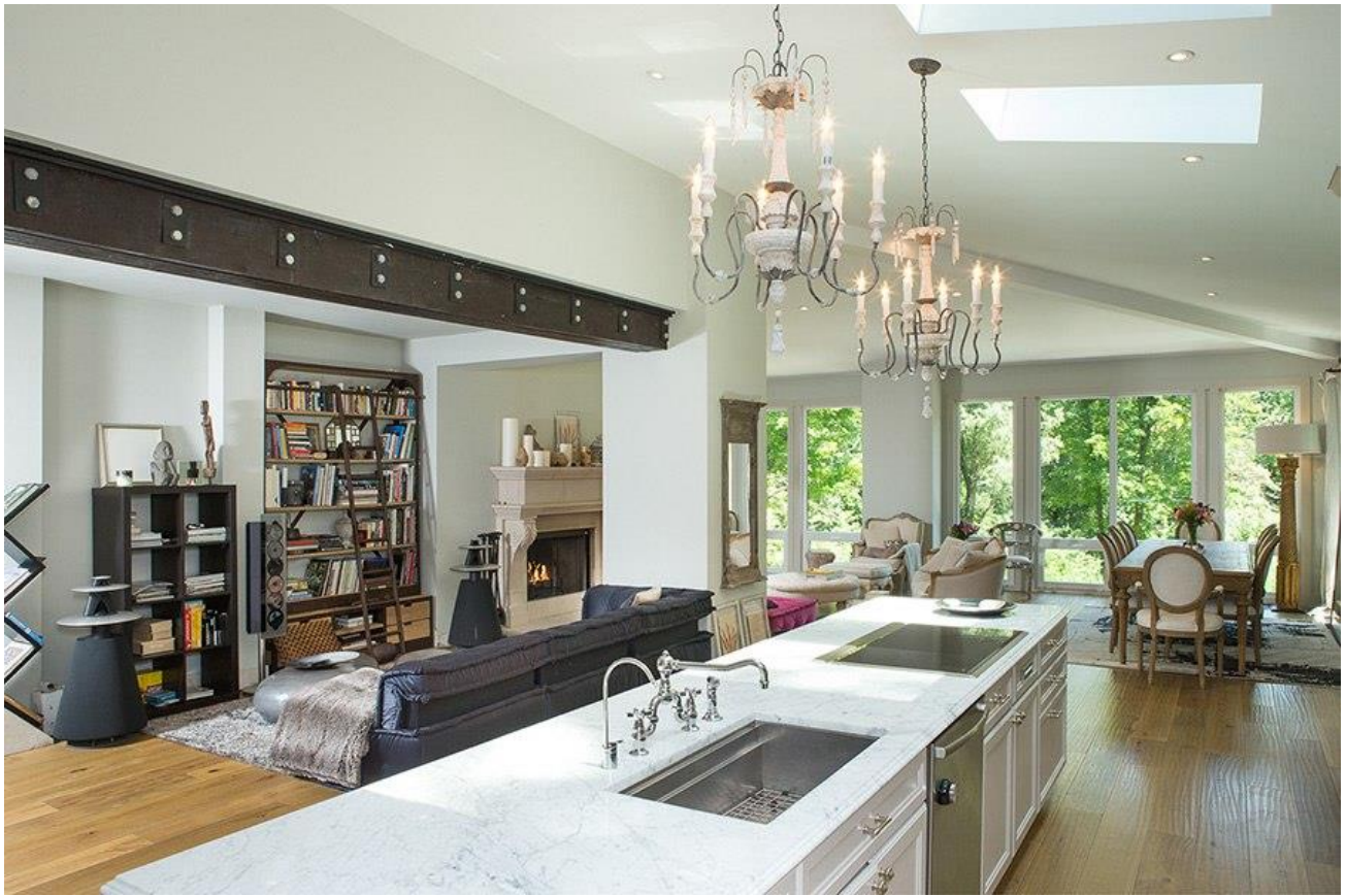
The open-plan main level.