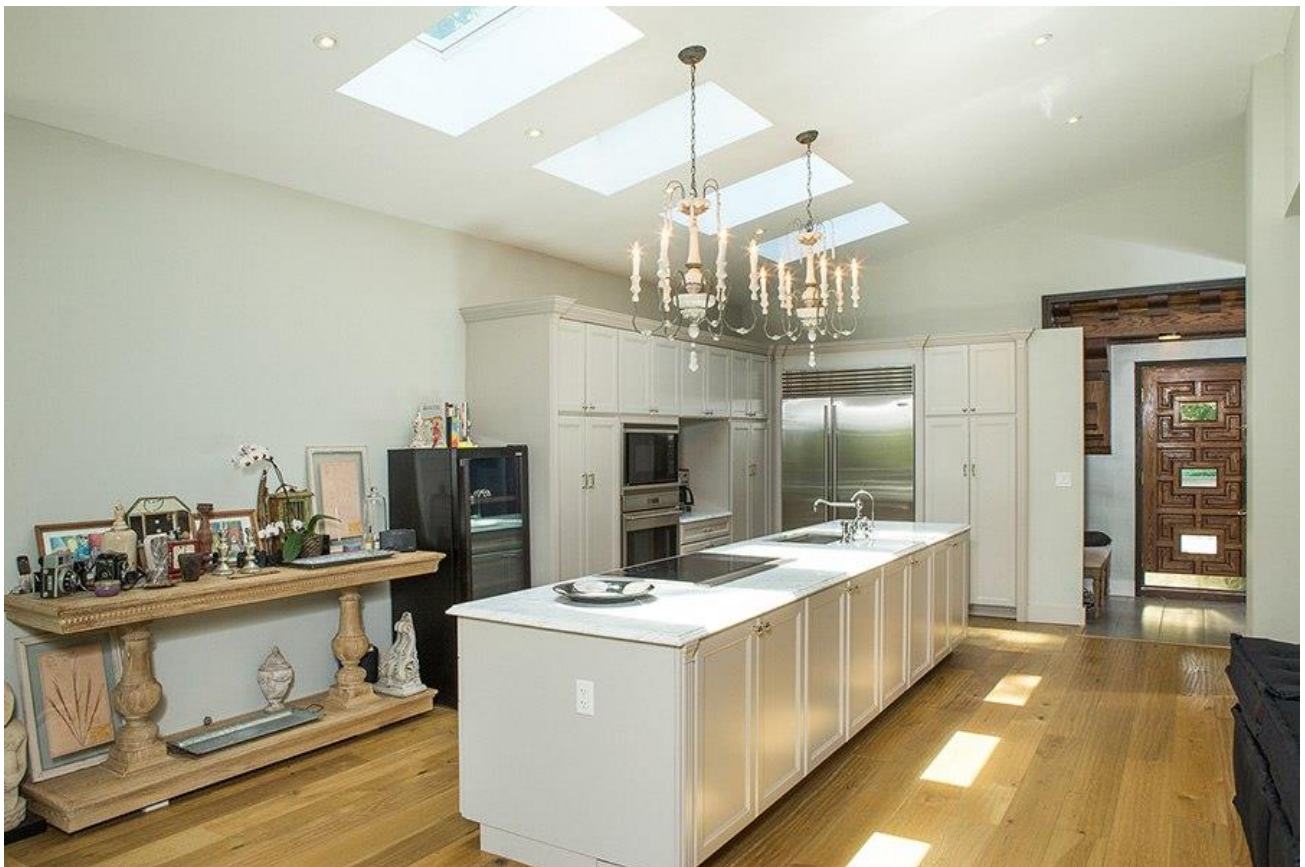
The airy kitchen is illuminated by skylights in a vaulted ceiling.