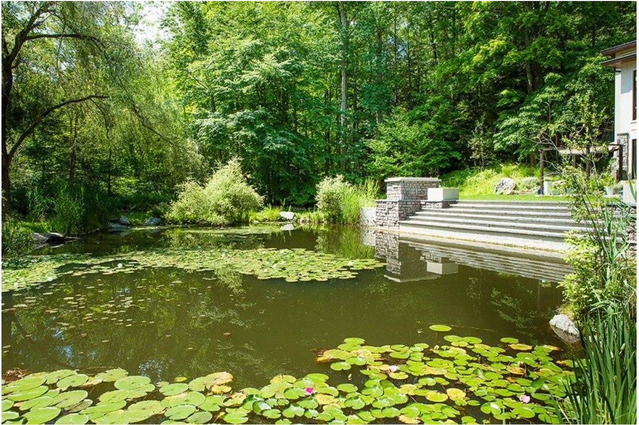
The lily pond.