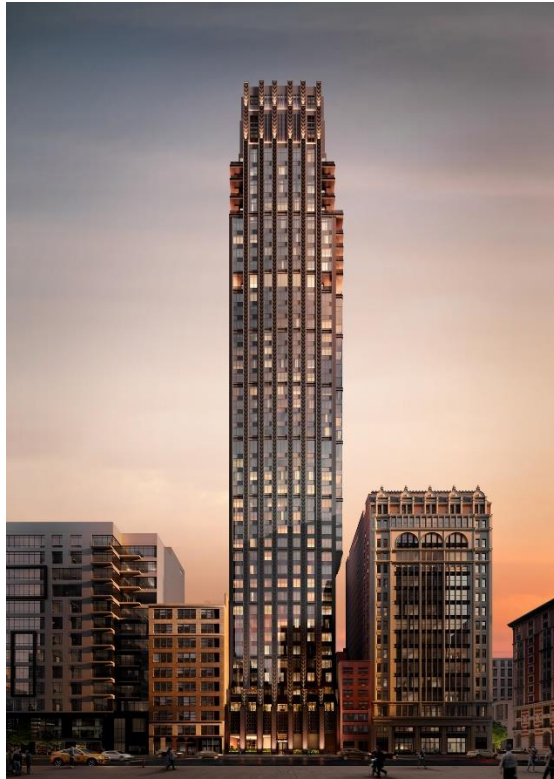
Rendering of the northern elevation. Courtesy of Rockefeller Group