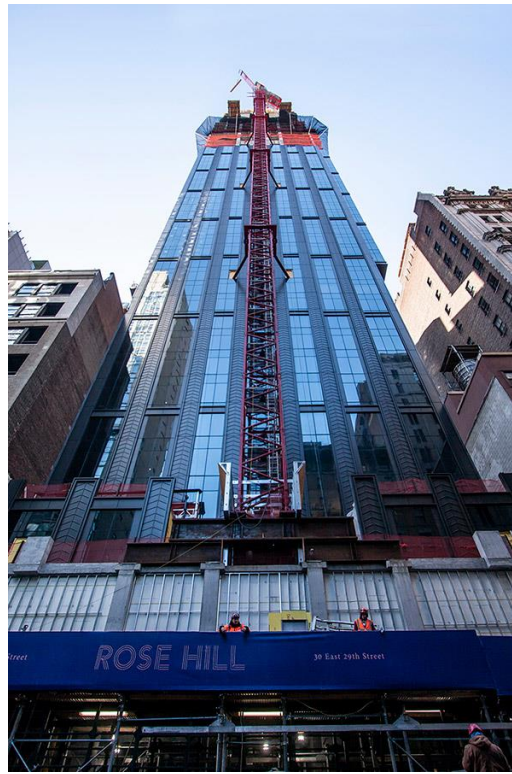
Construction progress at Rose Hill

The Rose Hill residential tower at 30 East 29th Street now stands more than 600 feet above NoMad, Manhattan where construction has officially topped out. Designed by CetraRuddy Architecture for the Rockefeller Group, the 45-story building will contain 123 condominiums ranging in size from one to four bedrooms.