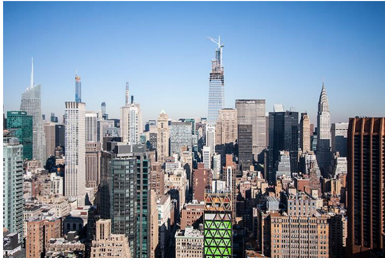
Views from atop Rose Hill.