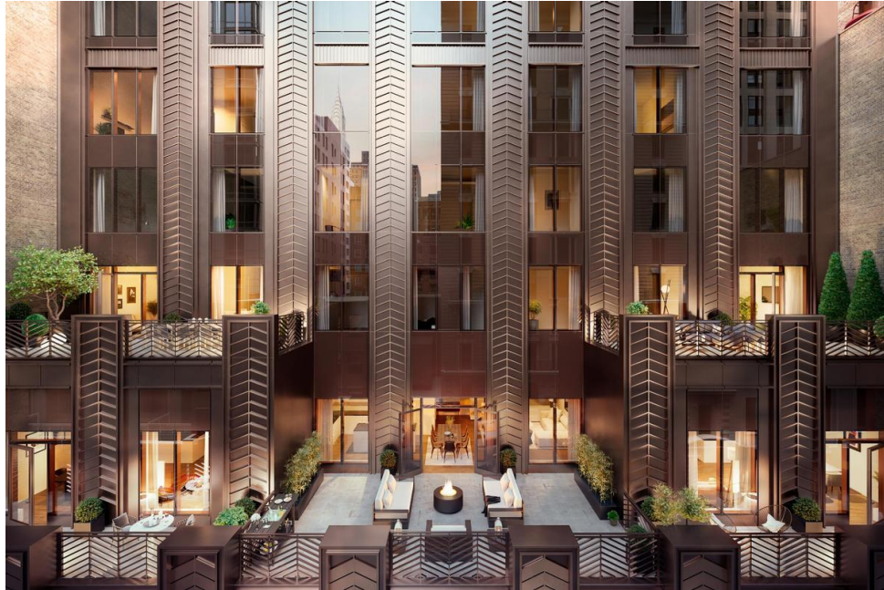
The building is taking shape at 30 East 29th Street in the NoMad district of Manhattan.

Prices for condos start at US$1.2m (€1m, £947,000).