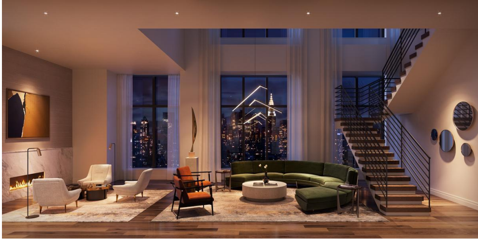
The property will comprise 123 studio to four-bedroom apartments. Image by Pandiscio Green/ Recent Spaces