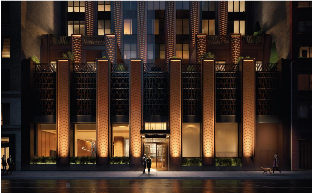
The 45-storey skyscraper is Rockefeller Group's first residential project in its 90-year history.

Property firm Rockefeller Group has published new renderings of its Art Deco-inspired Rose Hill tower, the company's first residential project since its founding in 1928.