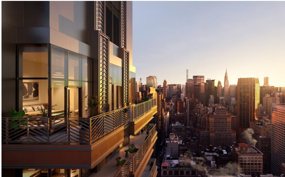
The façade will be clad in bronze-hued aluminum.