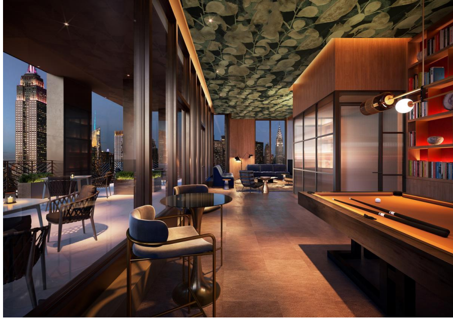
Rose Hill will also boast a variety of lounge areas.