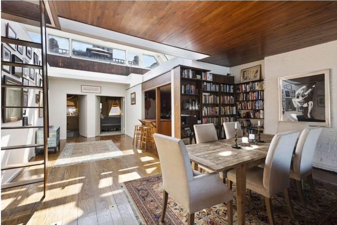
Pulitzer Prize-winning author Norman Mailer lived in this Brooklyn, N.Y., townhouse, transforming its top floor to look like a ship. Now the top-floor is on the market for $2.4 million.

The sale includes a four-floor walk-up, which was at one point transformed by the author to look like a ship, and a guest apartment below.