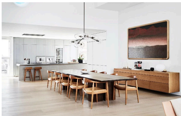
Carrie and Big's suggested new home - a $30m penthouse at 240 Park Avenue South