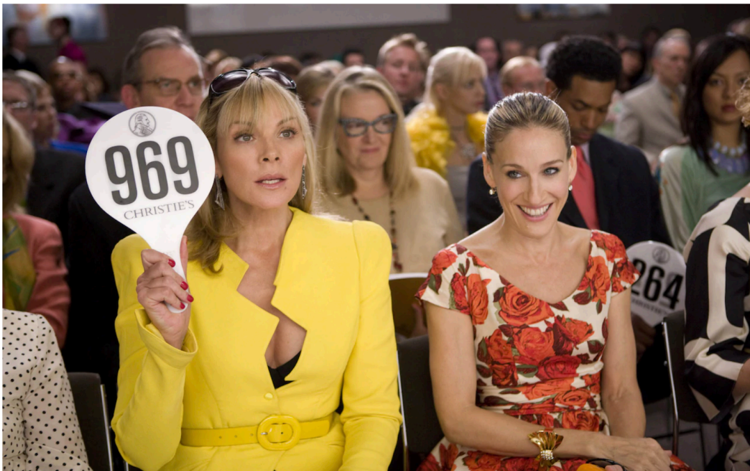
From Park Avenue penthouses to Upper East Side apartments, our property expert looks at where Carrie and co might call home

With the announcement of a Sex and the City reboot, our expert explores the on-the-market properties Carrie and her friends would choose now