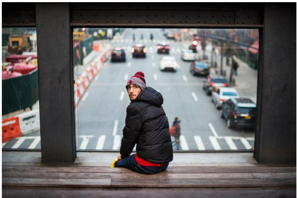
The High Line can seem like a seat from which to watch New York perform.

For subway service, most residents hike to Eighth Avenue, which offers C and E service, at West 23rd Street, and A, C and E service, at West 14th Street.