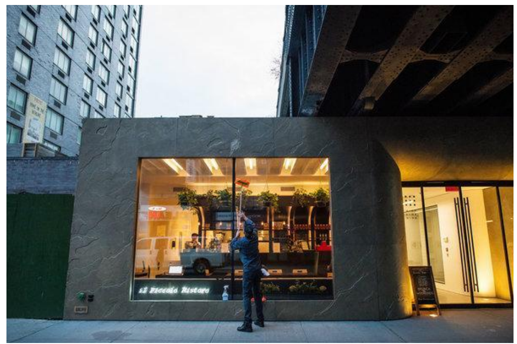
Art and commerce often seem to blend here: Il Piccolo Ristoro, on West 28th Street, is a coffee shop, although it resembles a gallery.

Restaurants that once largely catered to gallery patrons still dot 10th Avenue. Their ranks are thinning, however, with the closure of Trestle on Tenth, in May, and the Red Cat, which will close at the end of December. But Cookshop and the High Line Hotel, both at West 20th, remain popular draws.