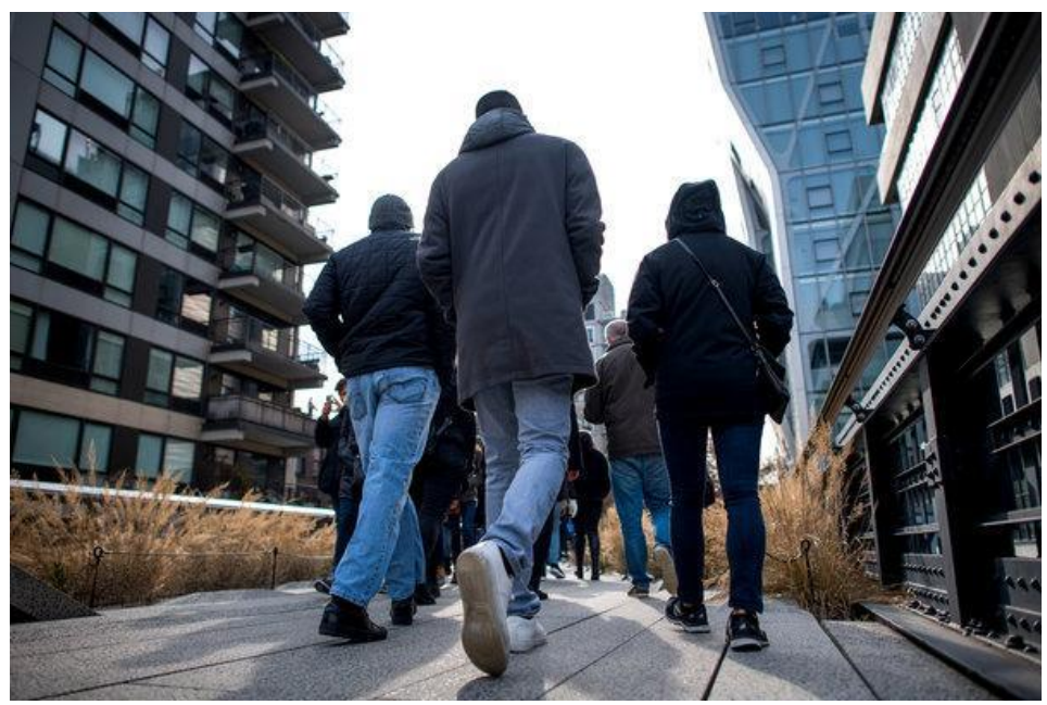
Even on cold days, tourists flock to the walkway, which winds from the meatpacking district to Hudson Yards. In 2017, about eight million people visited the High Line, where views into nearby apartments are almost unavoidable.

The first phase of the 1.45-mile park, which runs from Gansevoort Street up to West 34th Street, opened in 2009, with the bulk completed by 2014; a spur at 10th Avenue and West 30th Street is still in the works and expected to open next year.