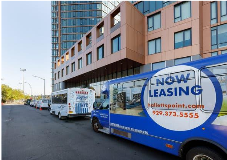
Halletts Point, in Astoria, Queens, offers residents a shuttle bus to the nearest subway, about a 20-minute walk away.