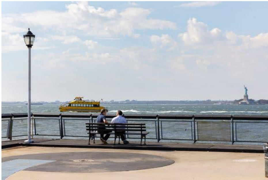
The view from Louis Valentino, Jr. Park and Pier in Red Hook, Brooklyn, where ferry service has made the waterfront neighborhood feel less remote for some residents who commute elsewhere for work.

New developments in transit deserts have also attracted New Yorkers who don't fear a longer or nontraditional commute.