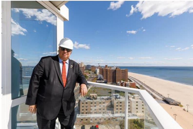
John Catsimatidis, the developer of Ocean Drive, stands on a balcony overlooking the beach. Prices at the towers range from $2,500 to $3,500 a month for smaller units — ambitious pricing for an area far from the train.

Some builders are aiming higher than others. On the sandy tip of Coney Island in Brooklyn, a 10-minute bus ride (or 30-minute walk) to the subway, Red Apple Group is completing two 21-story luxury rental towers with a total of 425 units.