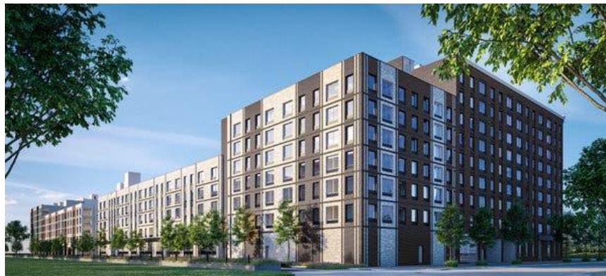
A rendering of a planned affordable project developed by Arker Companies in East New York, about a 20-minute bus ride to the subway.

While land costs around $75 a square foot to build in East New York, it could cost hundreds of dollars more in nearby Williamsburg, he said. And pricing pressure comes not just from residential developers, but also commercial tenants who bid up prices for warehouse space.