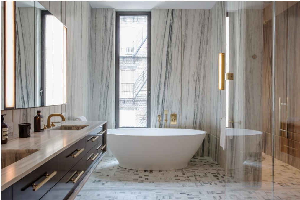
The master bath in the model unit at 150 Wooster offers a city view.