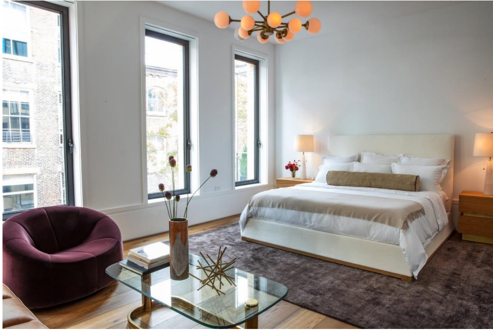
Large windows line the model apartment, offering views of SoHo's cast-iron and brick facades.