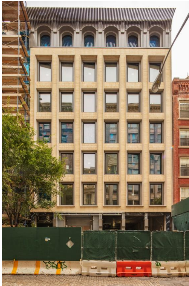
A New Building Mimics Old SoHo

SoHo is not an easy place to build. Empty lots are scarce. Many buildings require their residents to be working artists. And the neighborhood sits almost entirely in a historic district.