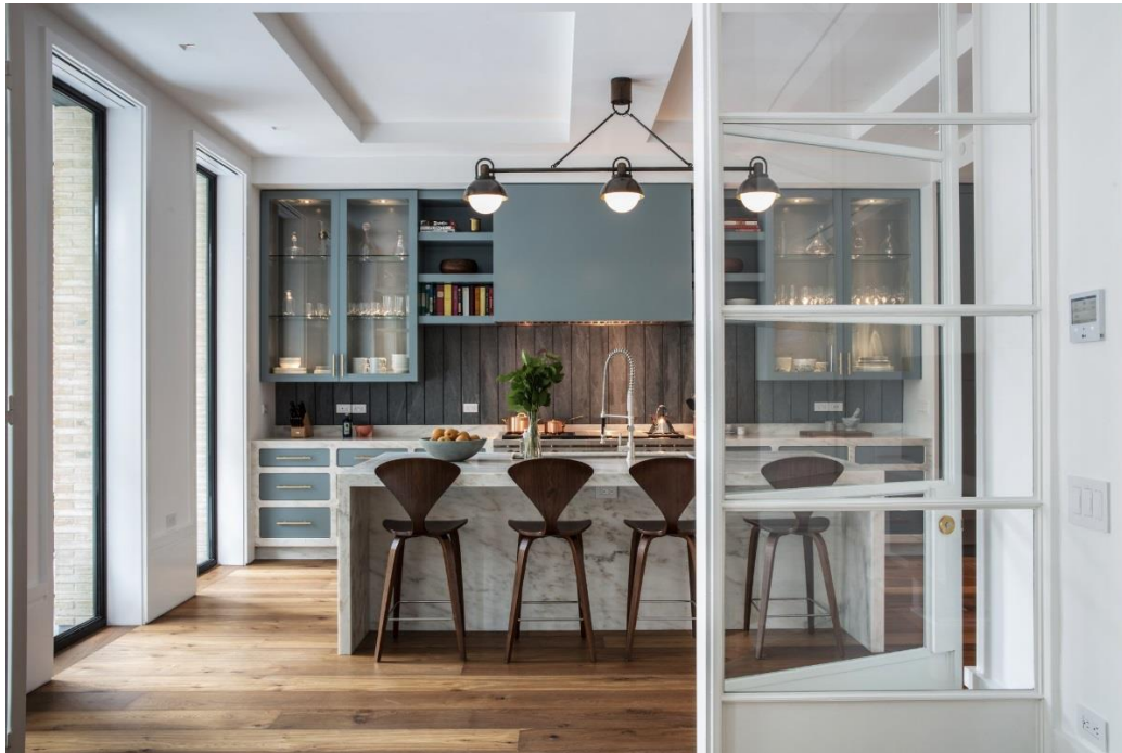
The kitchen in the model apartment at 150 Wooster makes abundant use of Vermont marble. The doors of the unit's two dishwashers are covered with the stone.