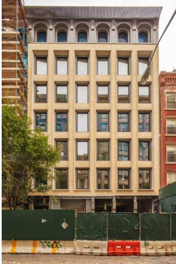
The facade of 150 Wooster, a new six-unit luxury condo in SoHo, is made of cream-colored brick and is topped by a ribbed cornice made of steel, which is a tribute to the cast-iron details of the neighborhood.