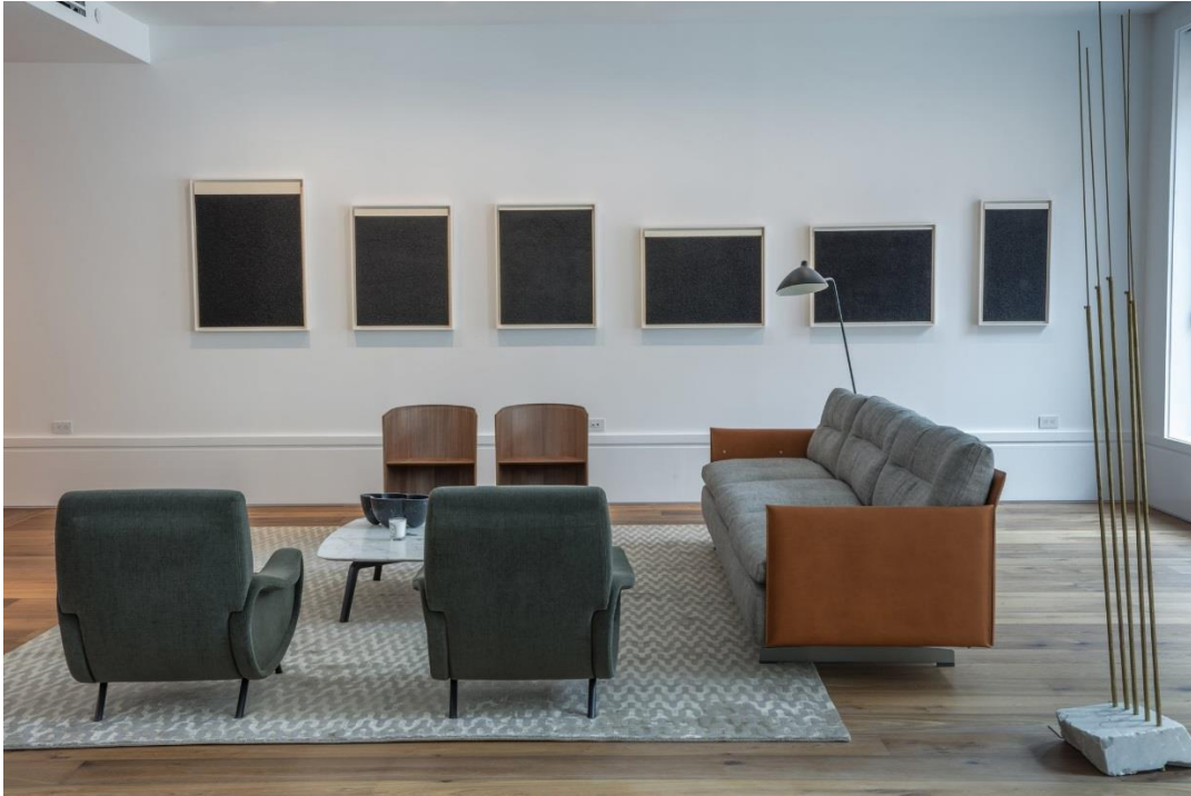
The living rooms are spacious at 150 Wooster, measuring almost 800 square feet.