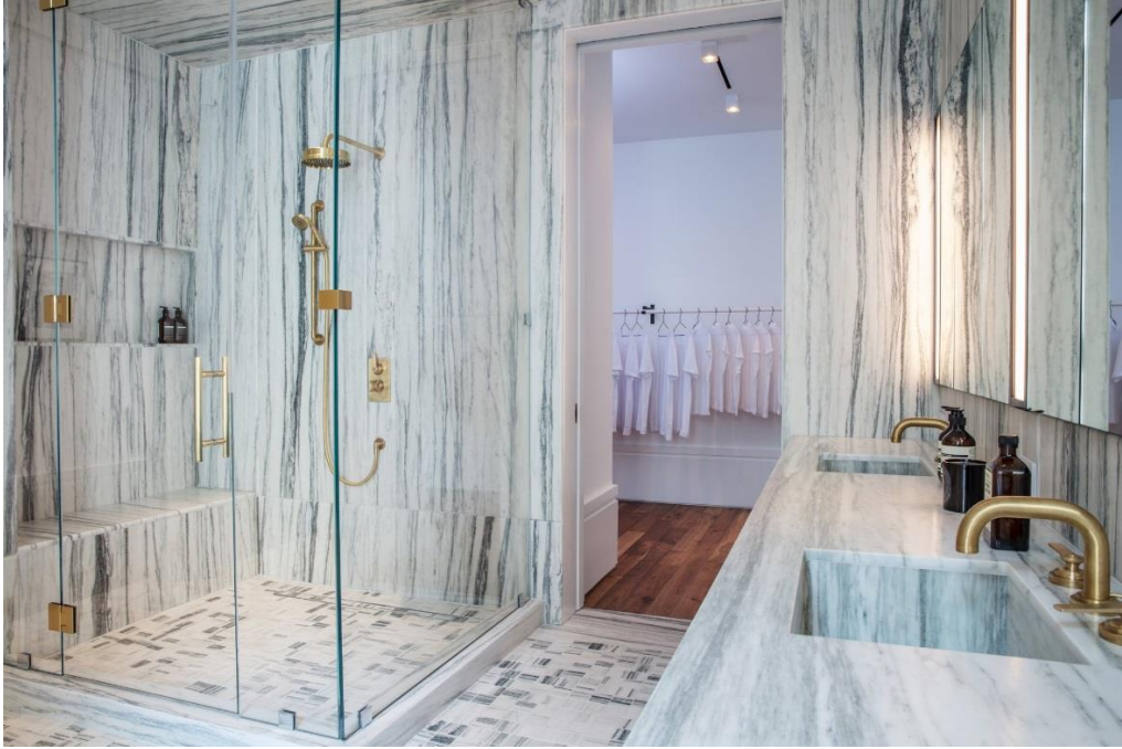
Veiny marble lines the master bath, which has two entrances, one from the bedroom, and the other from a spacious walk-in closet.