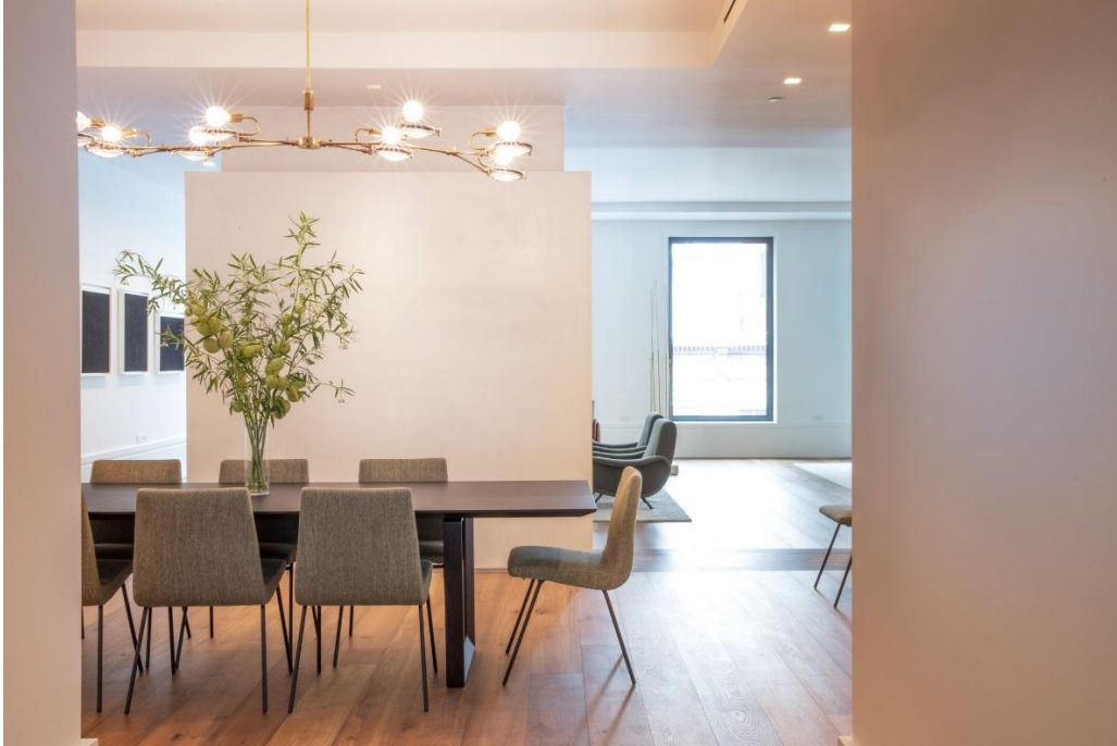
The dining room in the model apartment at 150 Wooster Street. The developer, KUB Capital, has tried to make the apartments look like classic SoHo lofts.