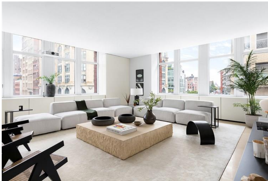
The couple's former apartment has the same minimalist vibe as the glimpses we've seen of their California home.

“I’ve stayed in a Claudio Silvestrin apartment since I was 26, and I love those types of palettes and that’s my opinion,” he said in the interview.