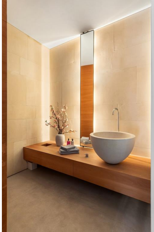
The home features natural hues that feel soothing and tranquil.

In an interview with Vanity Fair, the singer and fashion designer talked about how the Zen, monochromatic color scheme inspired his collection, which was shown during New York Fashion Week in 2015.