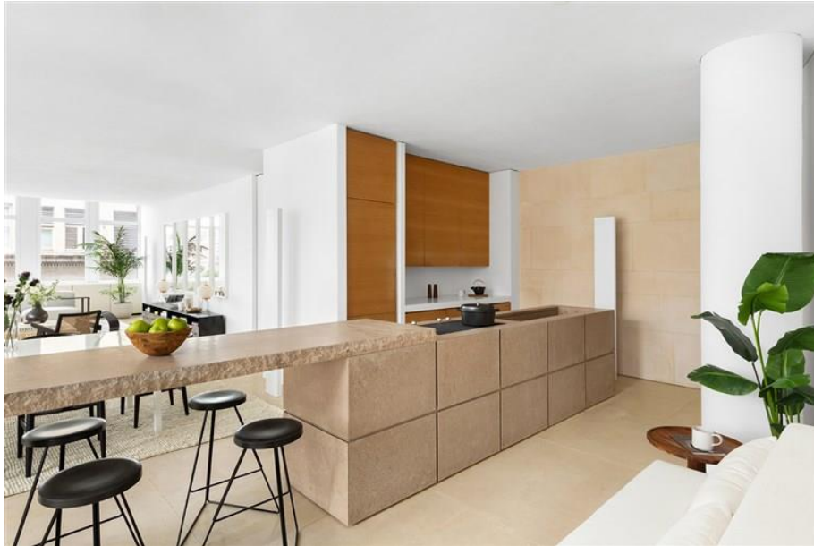
The kitchen feels so calming, it could almost be a spa.

The living area features an open layout, comprising the living, dining and kitchen areas. And large windows look out onto spectacular city views.