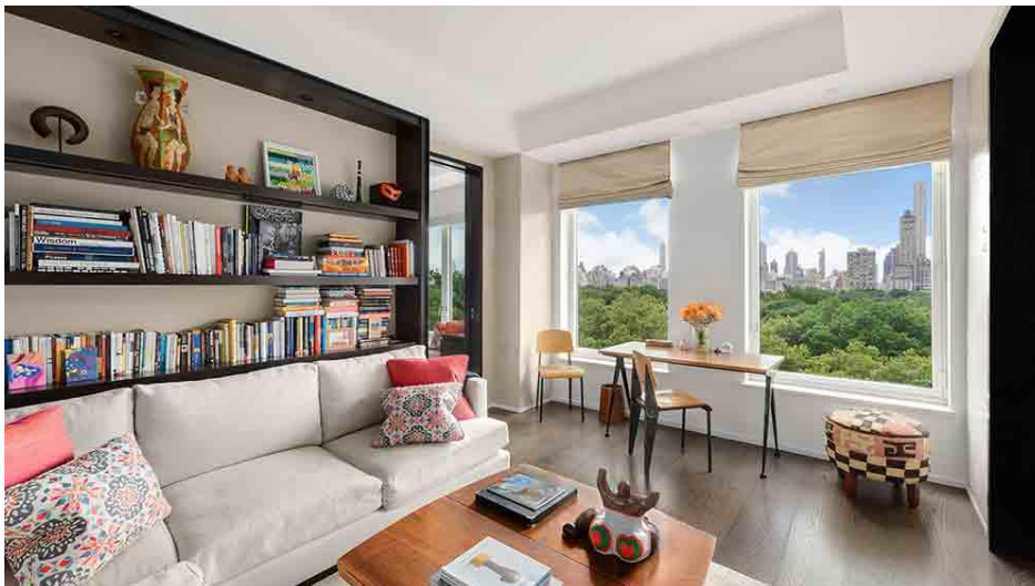
The library also has stunning views of the park.