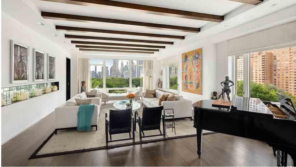
The spacious living room.

The primary suite is no less lavish, with its own views of the park, a fireplace, two walk-in closets and a dressing room. The bath is finished in Italian silver travertine and has a soaking tub, radiant floors and a separate steam shower. The three other bedrooms are all generous in size and include large closets and en suite bathrooms. The condo also includes a home office, a den and laundry room. Finishes throughout are done in a dark fumed European oak veneer on the doors and millwork, wide-plank oak floors, Moroccan wall tiles, handblown glass fixtures. The gallery also has lighting customized to highlight artwork.