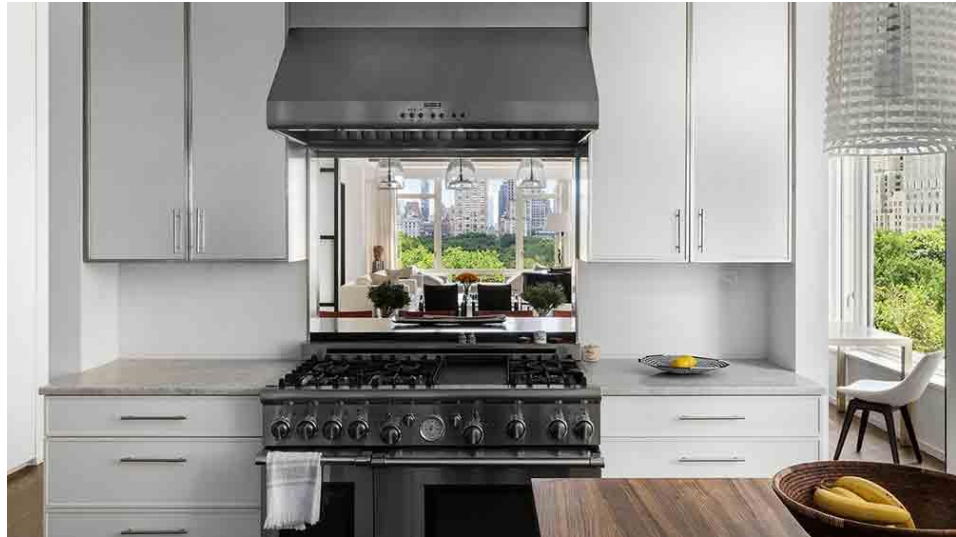
The Thermador cooktop.