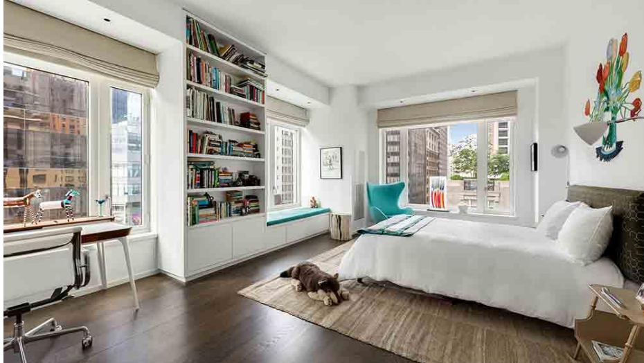
One of four bedrooms in the condo.