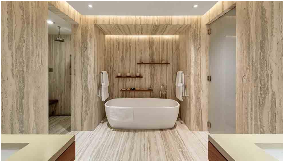
That incredible silver travertine.