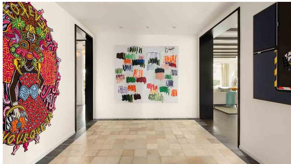
The gallery space off the foyer.