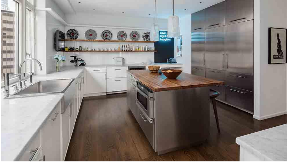
The kitchen was completely redesigned.