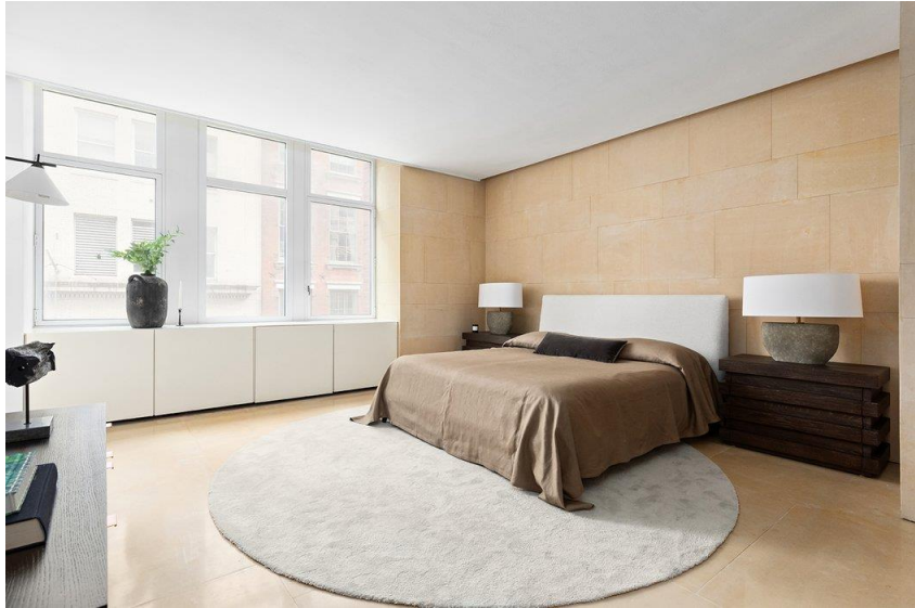
TIM WALTMAN FOR CORE

In photos styled by ASH NYC, the entire home appears to feature neutral tones, bright white walls and plenty of natural sunlight. The master bedroom is spacious with ample closet space, while the kitchen and bathroom are both anchored with monolithic stone islands.