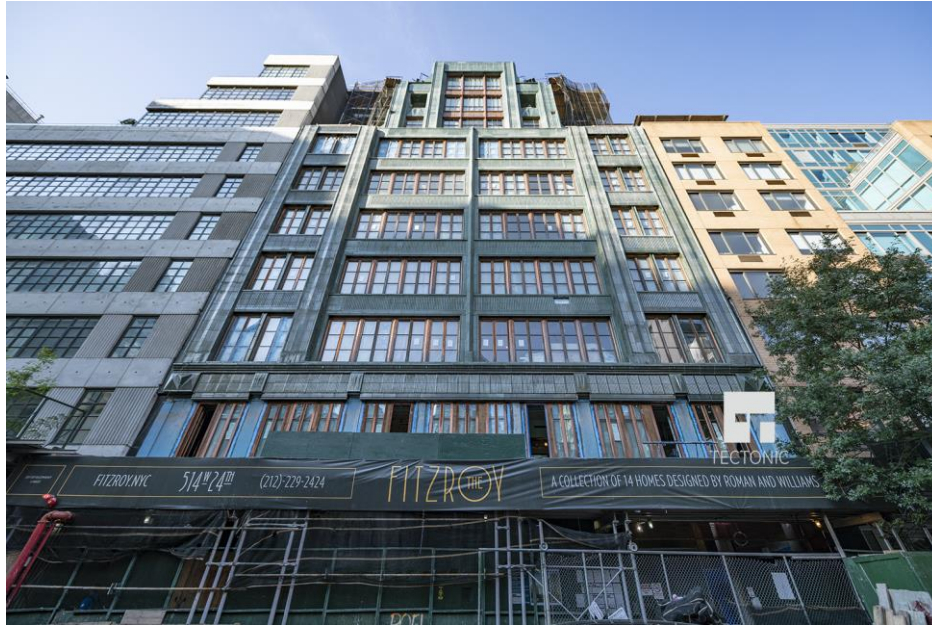
The Fitzroy, designed by Roman and Williams, photo by Tectonic

The building measures a total of nearly 65,300 square feet and is situated on the western side of the High Line. It stands 120 feet and ten stories to its rooftop, with 14 half and full-floor units situated within.