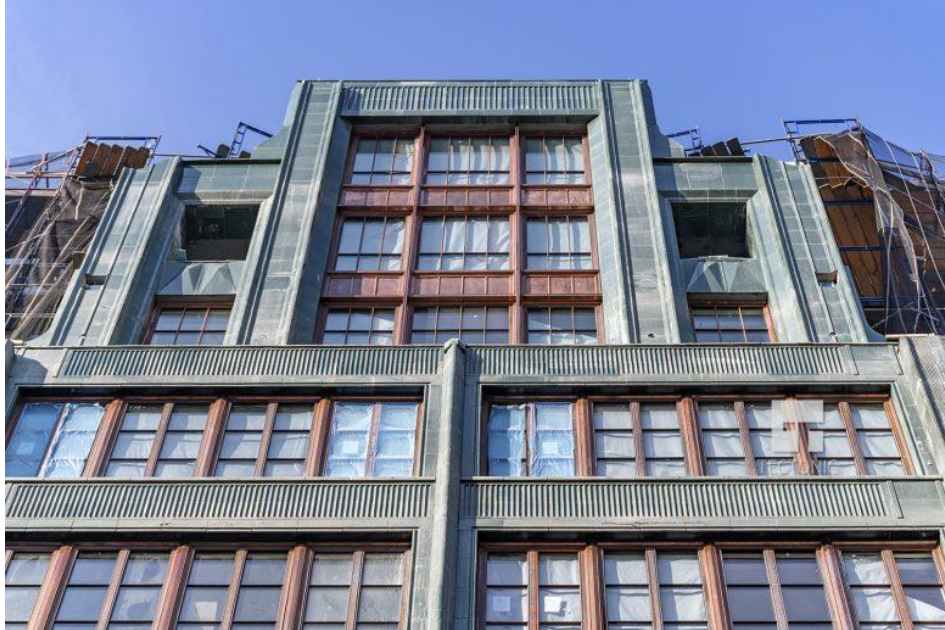
The Fitzroy, designed by Roman and Williams

One after another, each remaining vacant lot along the nearly 1.5 mile-long High Line is giving rise to some of the most architecturally innovative design across the Five Boroughs. Each of the new buildings has their own identity and aesthetics, jostling to be the next spectacle in West Chelsea. One long-awaited and highly anticipated project is The Fitzroy, at 514 West 24th Street, designed by Roman and Williams and developed by a partnership between JDS Development and Largo Investments. Now, the scaffolding has come down, revealing what hopefully won't be a once-in-a-lifetime revival of Art Deco stylings, built for contemporary sensibilities.