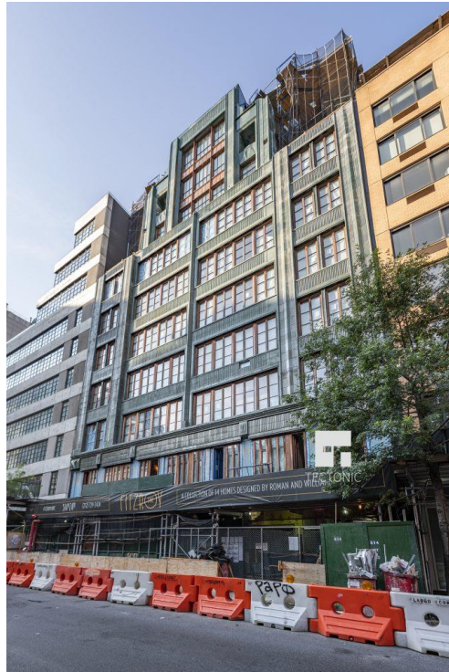
The Fitzroy from street level, designed by Roman and Williams

Inside, there are two- to four-bedroom units, each with northern and southern exposures through oversized windows. They start at $5.6 million, marketed by CORE. The penthouse on the ninth floor contains 4,328 square feet of interior space, including four bedrooms, a