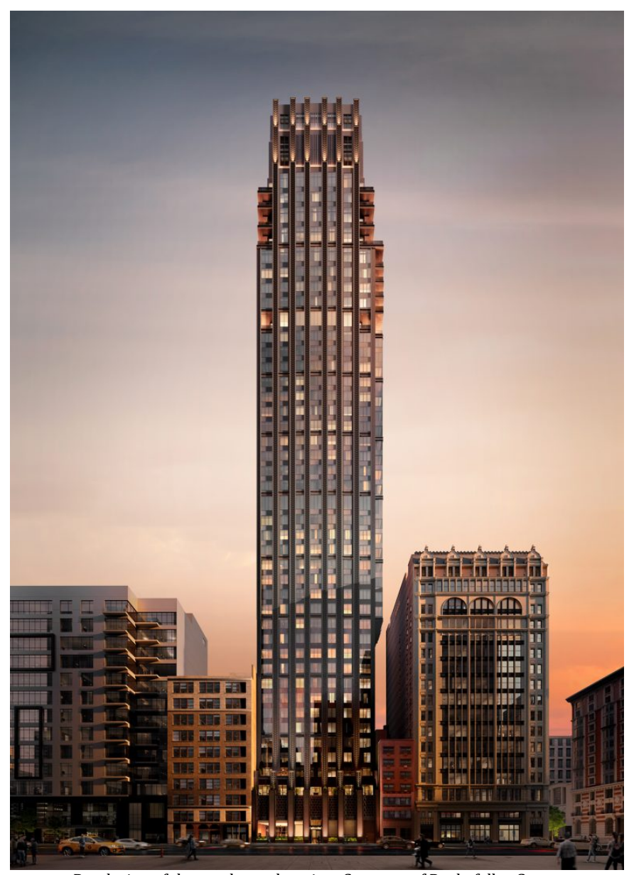
Rendering of the northern elevation.

Construction on Rose Hill, aka 30 East 29th Street, has passed the halfway mark. Designed by CetraRuddy Architecture, the 45-story NoMad skyscraper will stand out from the growing number of residential towers in the neighborhood with its dark-colored, Art Deco-inspired façade made of tall glass panels, terraces, and etched metal panels. Developed by Rockefeller Group, Rose Hill will eventually top out at 639 feet tall and have 123 condominiums marketed by CORE Real Estate.