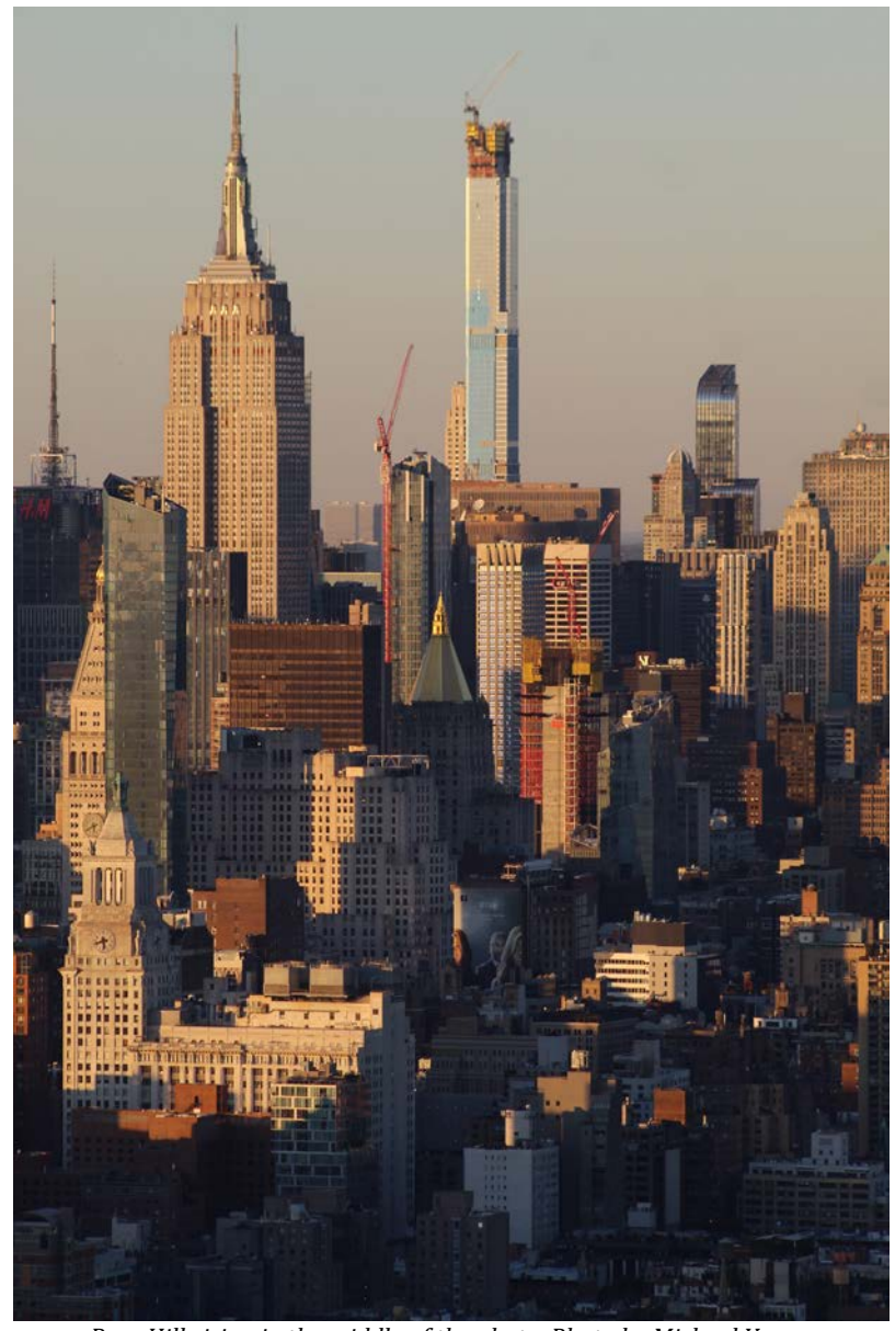
Rose Hill rising in the middle of the photo.

Rose Hill's distinctive design will be further enhanced at night, when its multi-level crown will be illuminated with upward-pointing spotlights aligned with the tight row of perimeter columns on all four sides of the structure.