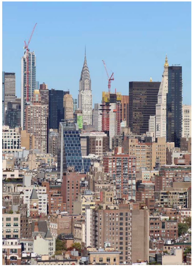
Rose Hill seen rising next to the Chrysler Building.