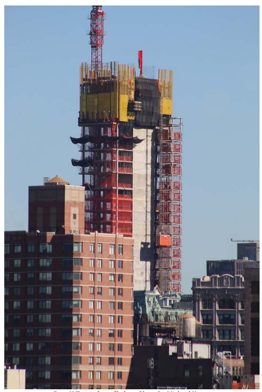
Rose Hill seen from Chelsea.

A portion of the façade can be seen in the photo below. The dark color will strike a contrast against the sky and the surrounding light-colored edifices.