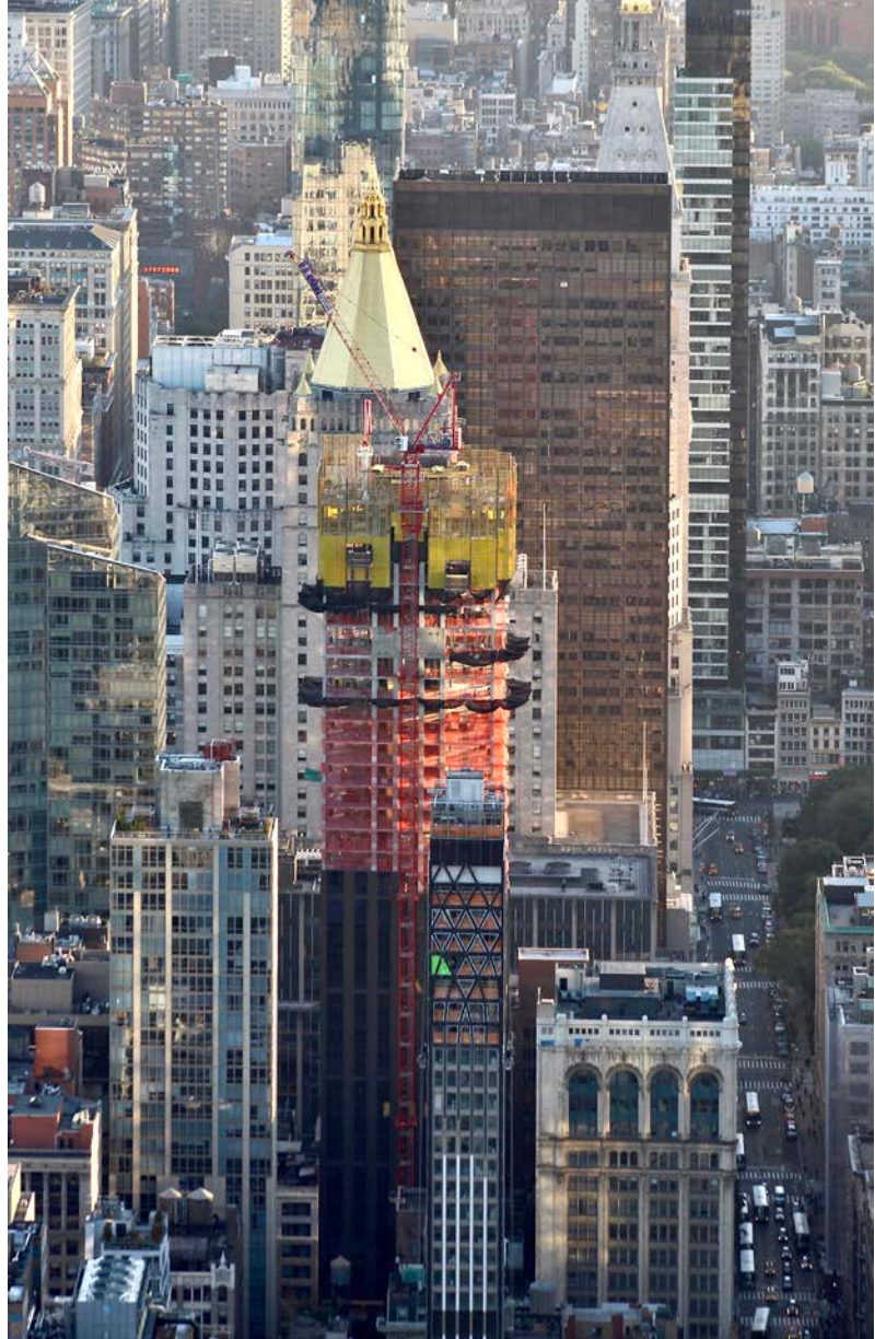
Rose Hill as seen from One Vanderbilt.

The photos below show the presence of the superstructure and the impact it will soon have on the skyline.