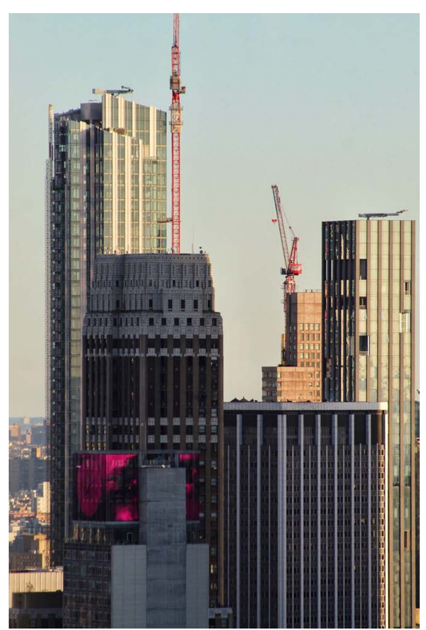
Rose Hill's crane peeking behind Sky House.