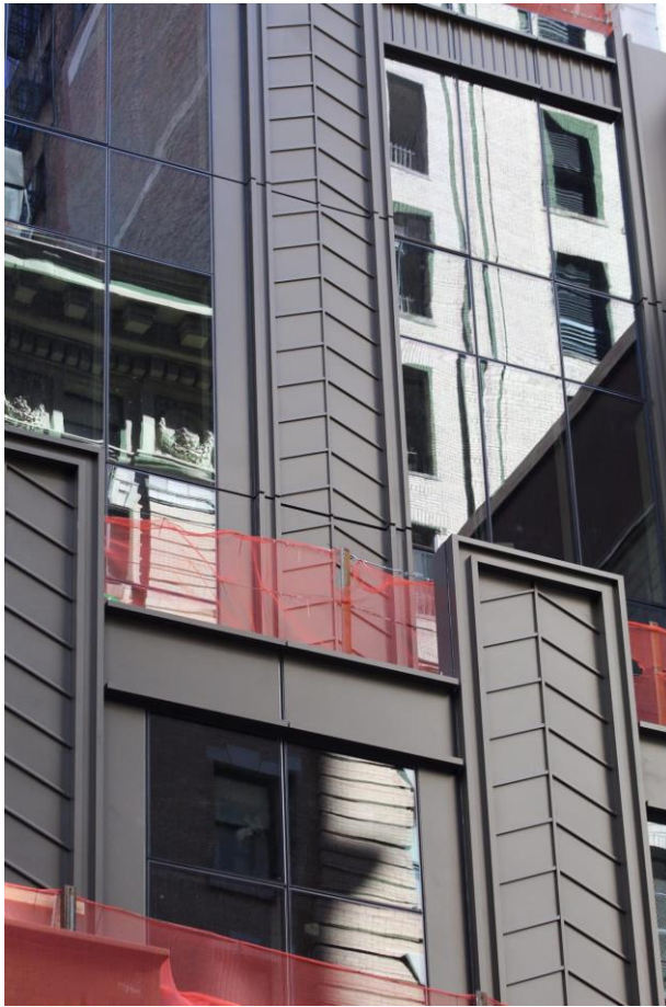
The Art Deco-inspired panels seen on the podium and first residential floors.