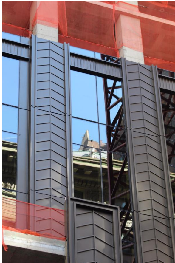
The upward-pointing chevron pattern will be found on all the dark-colored panels between the glass windows.