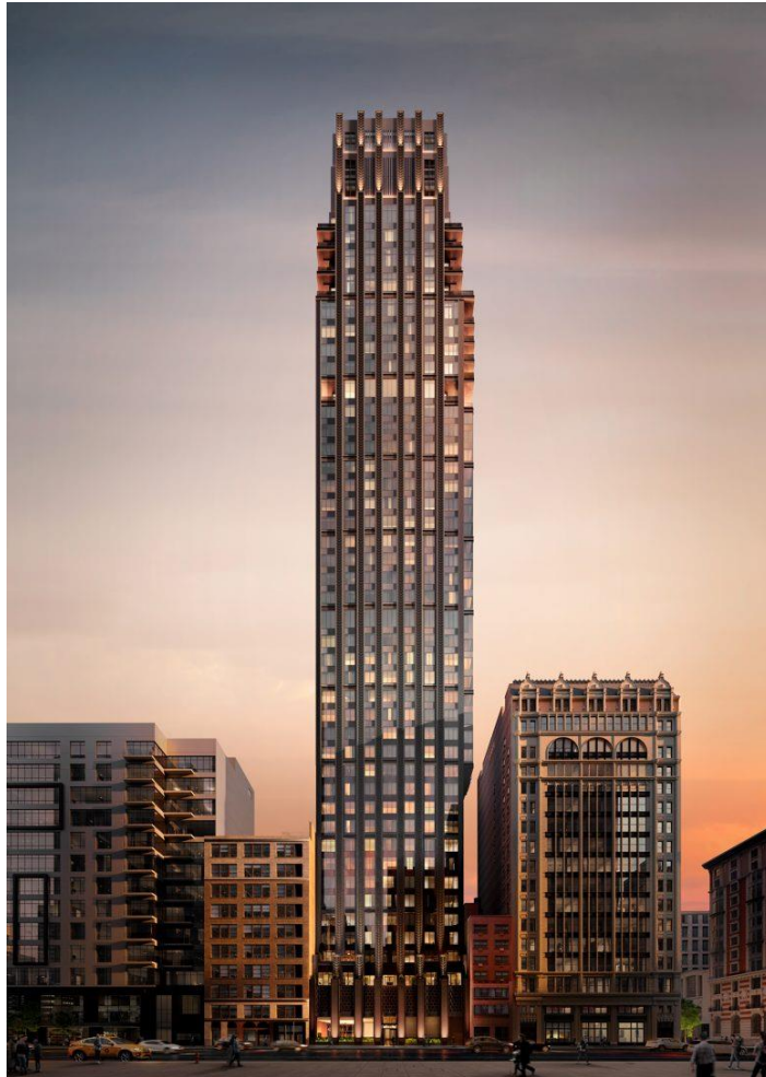
Rendering of the northern elevation.

Installation of the dark-colored curtain wall panels has begun at Rose Hill, aka 30 East 29th Street, in NoMad. The Art Deco-inspired envelope now covers the podium and first residential floors of the future 45-story skyscraper, which is located between Madison Avenue and Park Avenue South. Designed by CetraRuddy Architecture and developed by Rockefeller Group, the tower will stand 639 feet tall and become one of the most prominent structures in the neighborhood. CORE is managing sales and the marketing of the units.