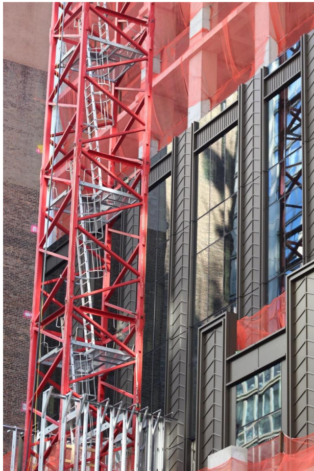
Looking east at the northern elevation.