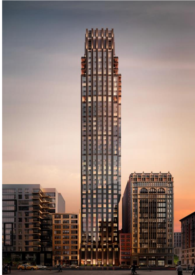
Rendering of the northern elevation.

The podium floors have now been built up and the first set of residential levels has begun assemblage. The tower will contain 123 apartments ranging from studios to four-bedroom residences. The 40th to 43rd floor will feature duplexes with two-story-high windows and private terraces that span the depth of the eastern and western elevations. In total, 30 East 29th Street will yield about 226,000 square feet of space, with 167,000 dedicated to the residential units.