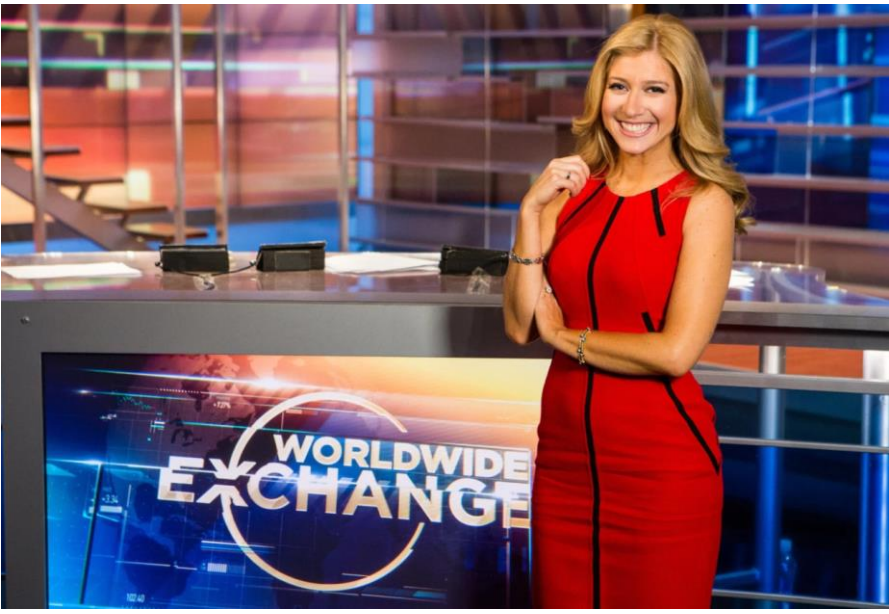
Sara Eisen

It comes with details like 12-foot beamed ceilings, exposed brick walls, oversize windows and polished concrete floors.