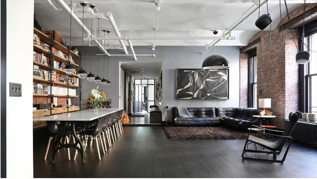
This loft in NoHo has an open concept kitchen and living area, with an island that can seat up to seven people. Union Studio