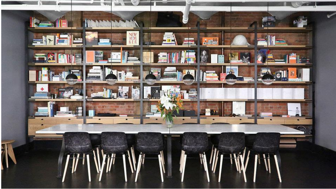
Twelve or more people can sit in the open concept dining area. Union Studio