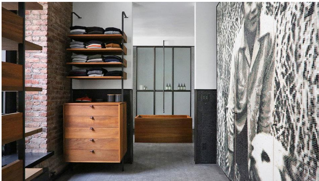
The master suite has a dressing room and a large bathroom. Union Studio