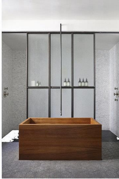
The master bathroom has a teak bathtub and a double shower. Union Studio