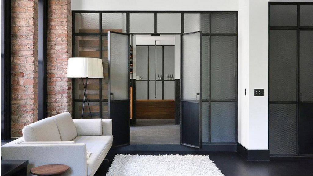
The master suite, with exposed brick and large windows. Union Studio