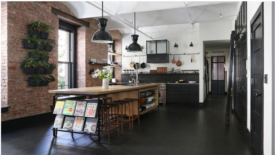
Black-and-white marble appear on the kitchen backsplash and the bathrooms. Union Studio