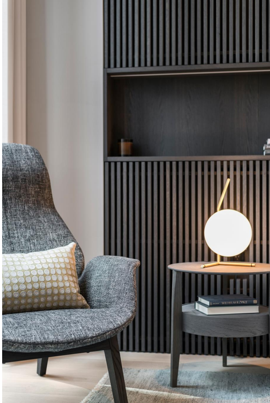
Bedroom of model unit.