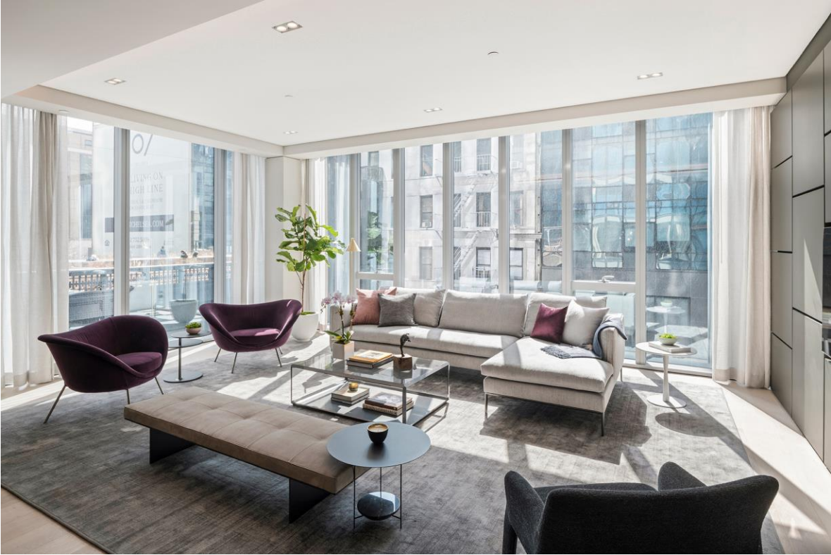
Living room of model unit.