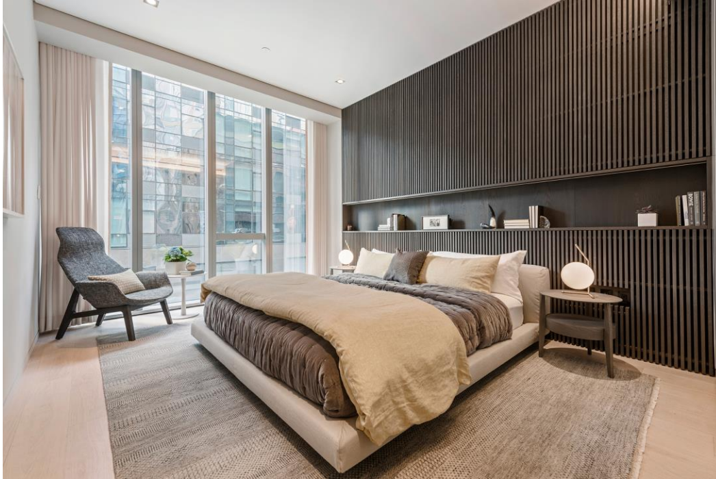
Bedroom of model unit.

Inside, find two- and three-bedroom units, along with a five-bedroom penthouse, with “materials and finishes selected to touch the senses, like pietra gray marble and engineered timber floors” says Chan. State-of-the-art Bulthaup kitchens, Gaggenau appliances, Molteni millwork, and Lutron shading systems lend even more luxury. And just like its surrounding neighborhood, amenities abound. Along with a round-the-clock attended lobby and direct keyed elevator access, each unit comes with private storage spaces and a residents-only rooftop terrace complete with an outdoor kitchen.