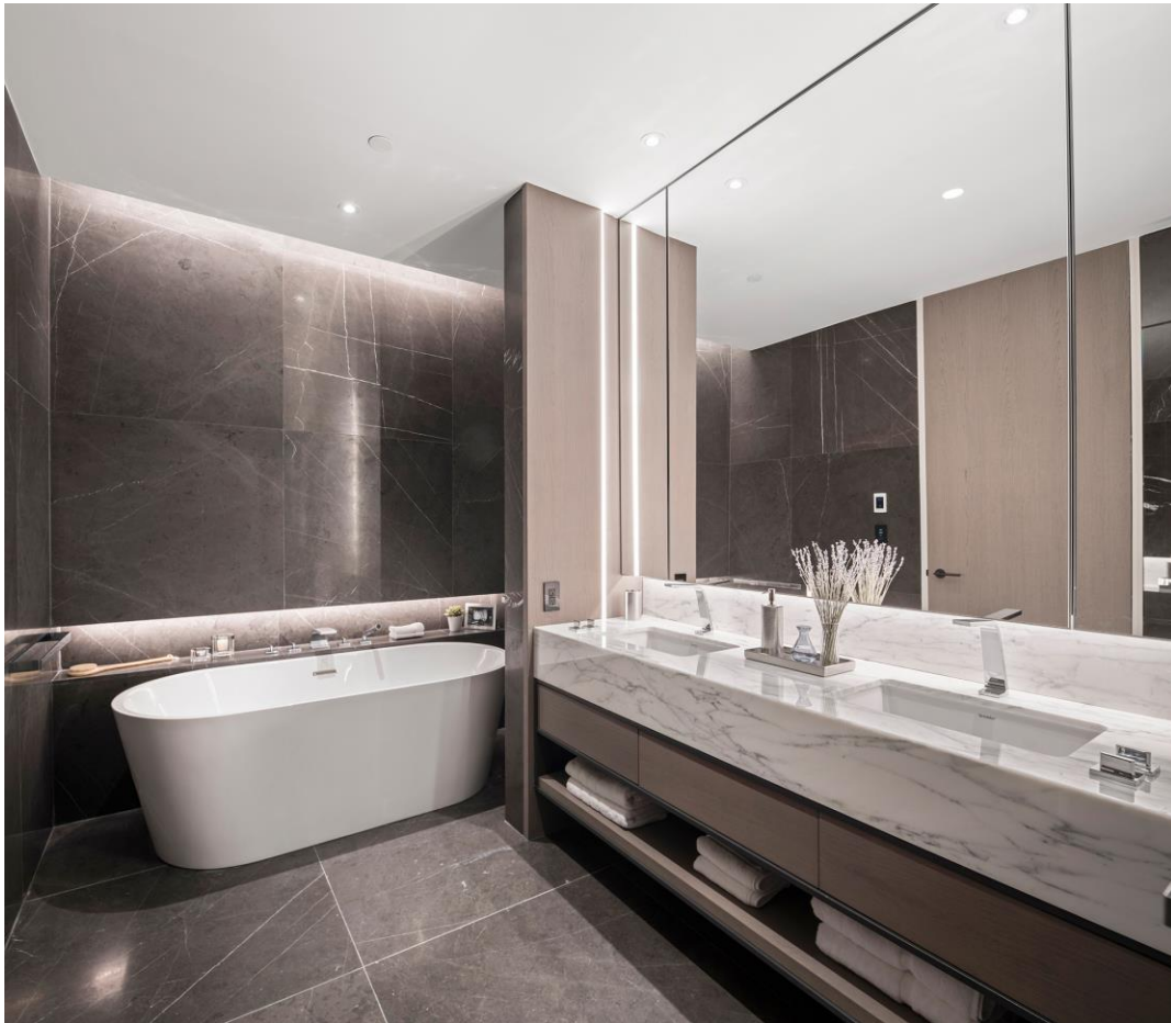
Bathroom of model unit.