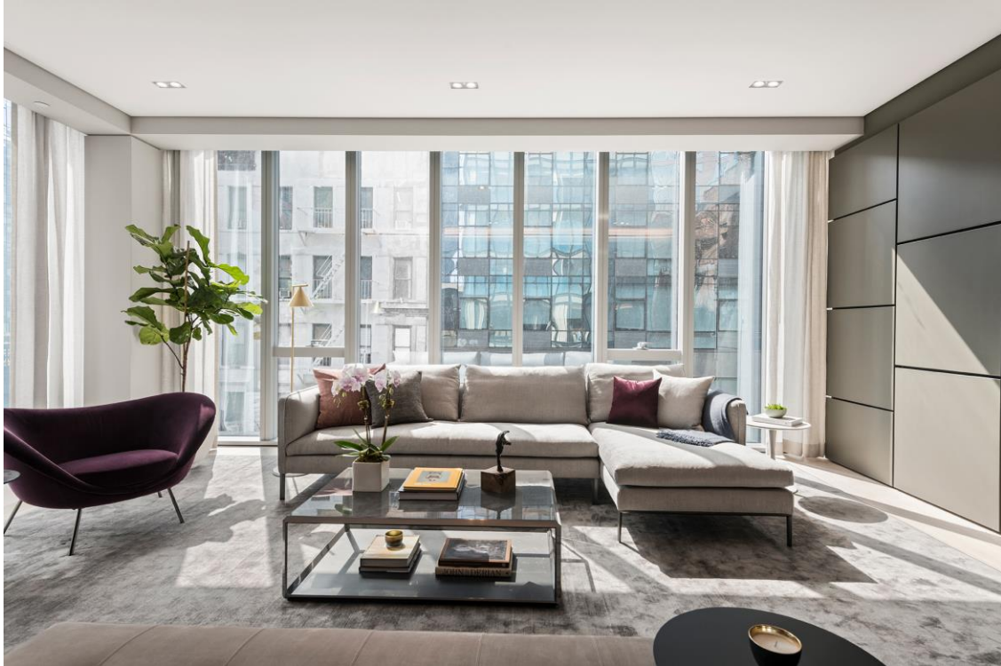
Living room of model unit.

But this isn't the building's only defining feature. Five One Five sits at the High Line's only 90-degree inflection, framing it on both sides. Each of the 15 units boasts parkside views—the only property in Manhattan with this distinction. Its iconic site at a bustling thoroughfare didn't come at loss of privacy for residents, however. Principal Soo K. Chan, who oversaw all interior and exterior design details, incorporated a double-glazed tinted curtain wall, offering seclusion and transparency in equal measure.