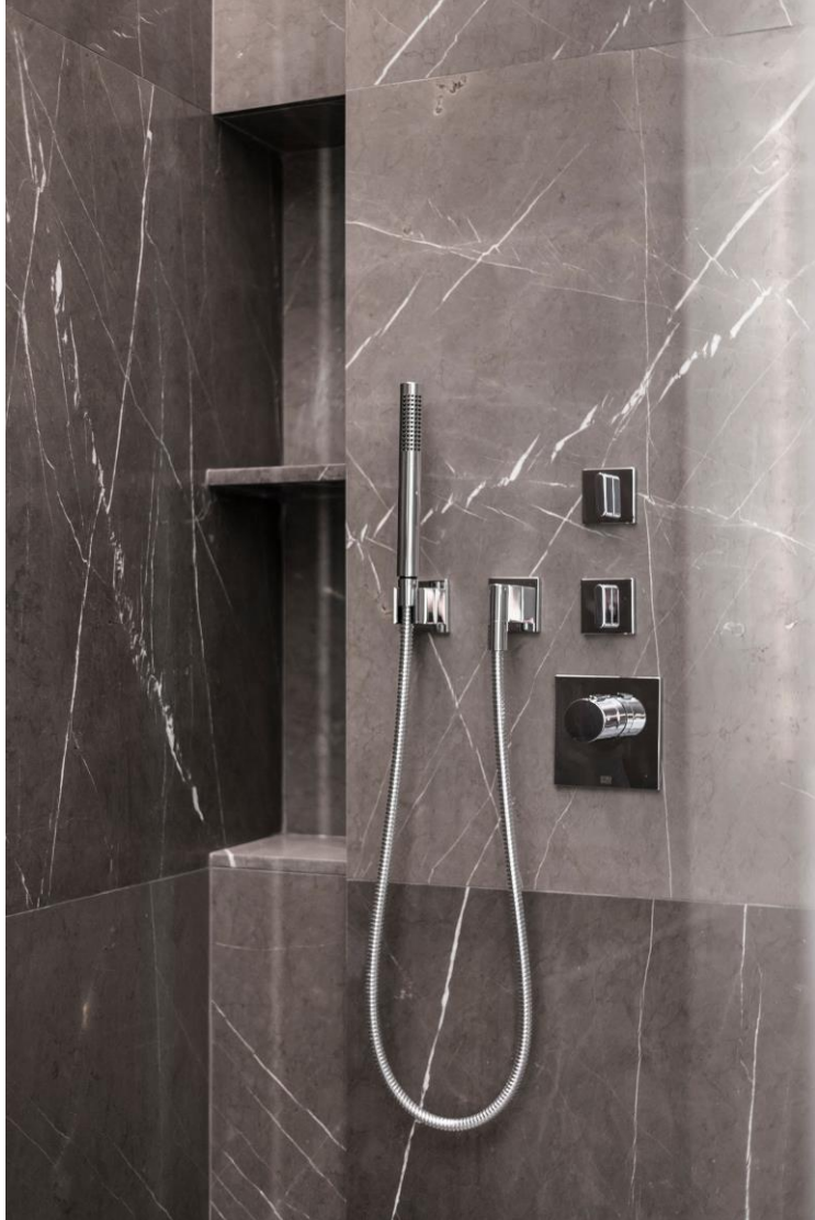
Shower of model unit.