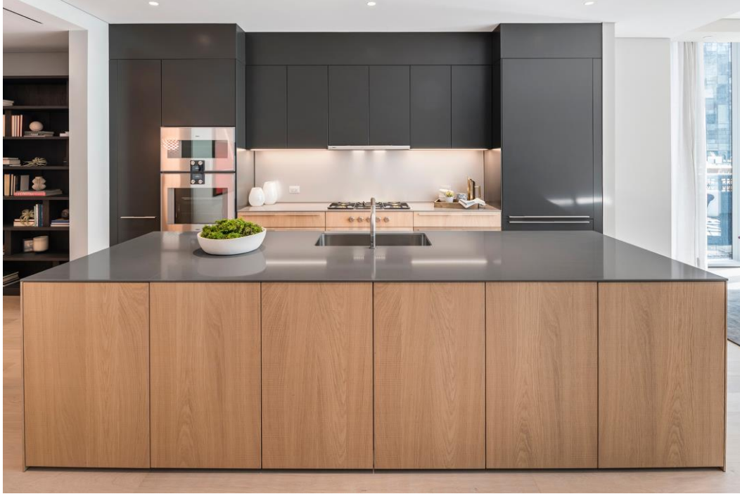
Kitchen of model unit.