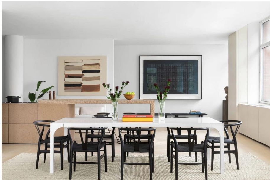
CORE