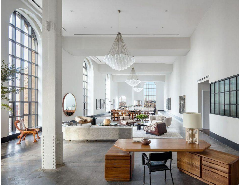
Living Room WWW.HOUSERIBECA.COM

A reimagined building inside the first ever Art Deco skyscraper in the world has a two-floor penthouse on the market for $39.95 million in Tribeca—currently the record holder for priciest neighborhood in New York City.