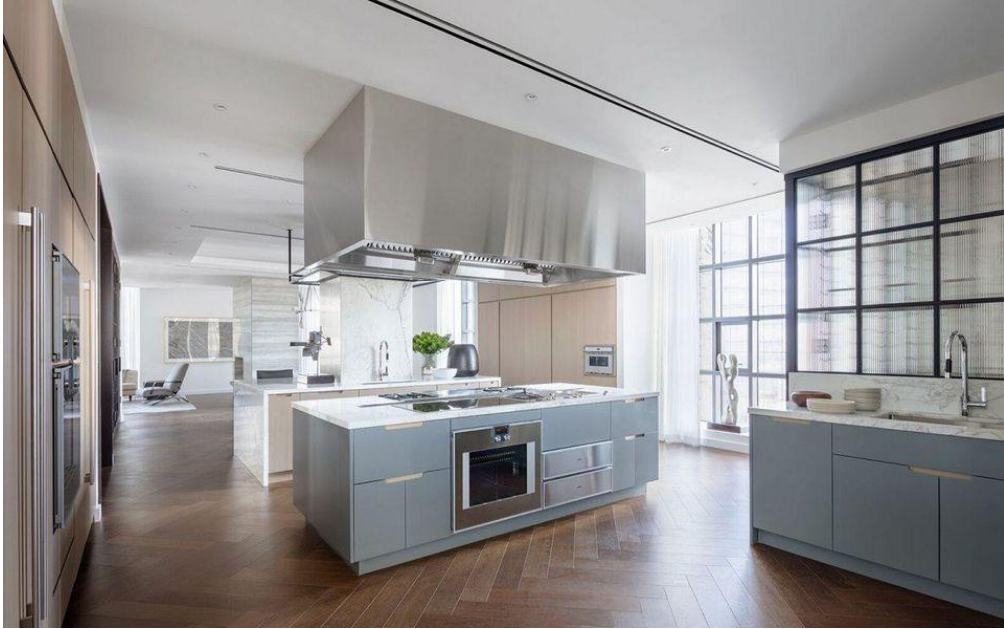
First kitchen rendering WWW.HOUSERIBECA.COM