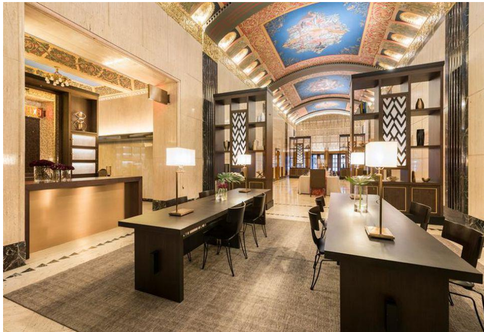
Lobby ceiling RICHARD CAPLAN

The landmarked building has retained its iconic lobby with hand-painted ceiling murals depicting the historical advancement of human communication, a homage to the building's original use for the American Telephone Company.