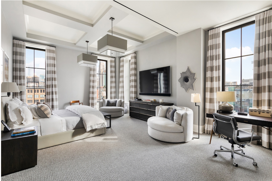
The oversized, corner master suite boasts coffered ceilings and generous closet space.