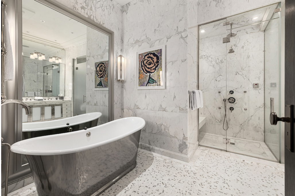
The master bath with a freestanding cast-iron bathtub, a steam shower with body sprays and rain, handheld and standard showerheads, and heated towel racks, all by Waterworks, is a beautifully designed oasis.