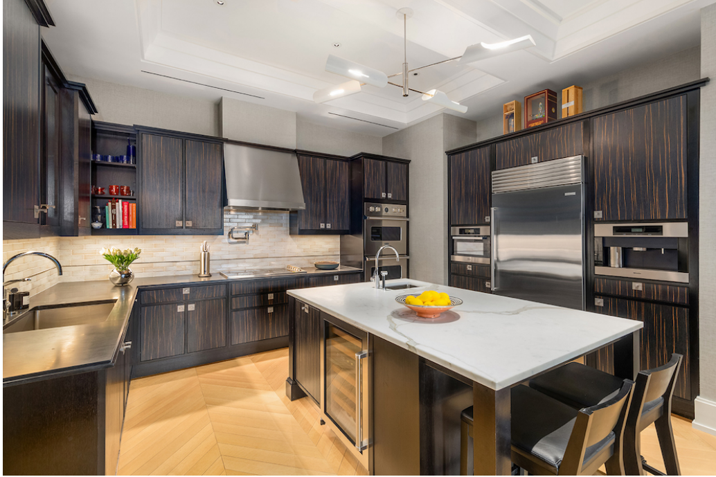
A custom-designed Smallbone kitchen with marble and limestone countertops and Dornbracht fixtures is outfitted with top-of-the-line appliances including a six-burner cooktop, wall oven and warming drawer by Viking, wine cooler, under-counter refrigerator/freezer drawers by Sub-Zero, speed oven and built-in coffee maker by Miele, and a Franke water filtration system. The kitchen opens to the living and dining room.