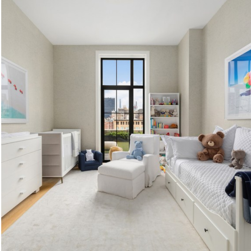
The incredibly proportioned secondary bedrooms have an en-suite bathroom with custom marble details and direct access to the terrace.