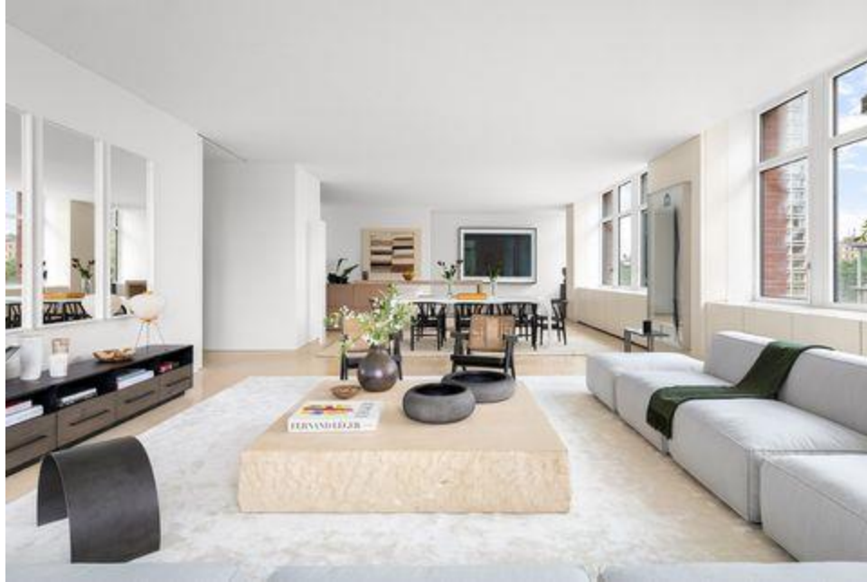
Tim Waltman for CORE

The space is a combination of two units in the building.