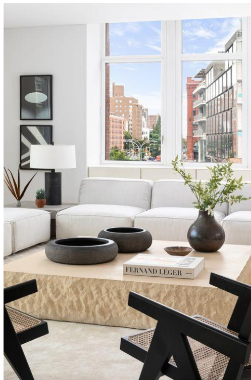
Tim Waltman for CORE

A total of 13 large windows lead to the living areas.