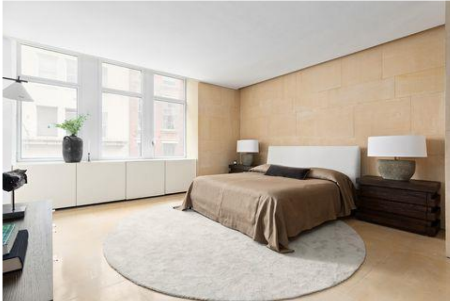
Tim Waltman for CORE

It also includes ample closet space and radiant floor heating.