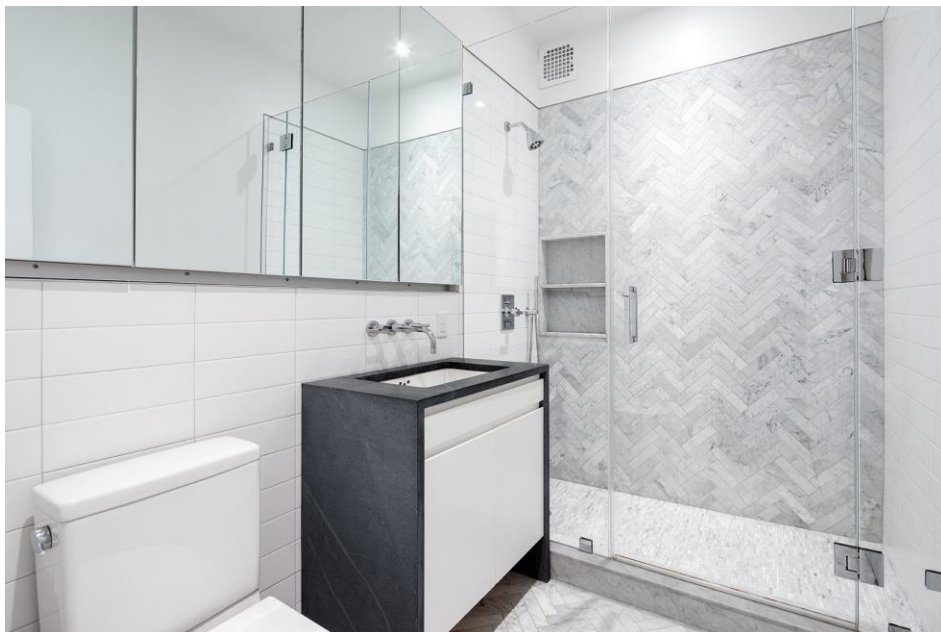
The bathroom on the second level.

The chic master bedroom on the upper level has a bay-window sitting area, as well as a full bathroom with a large, walk-in shower. This room features Carrara marble, a custom vanity with Pietra Cardosa gray stone, and white lacquer cabinetry.