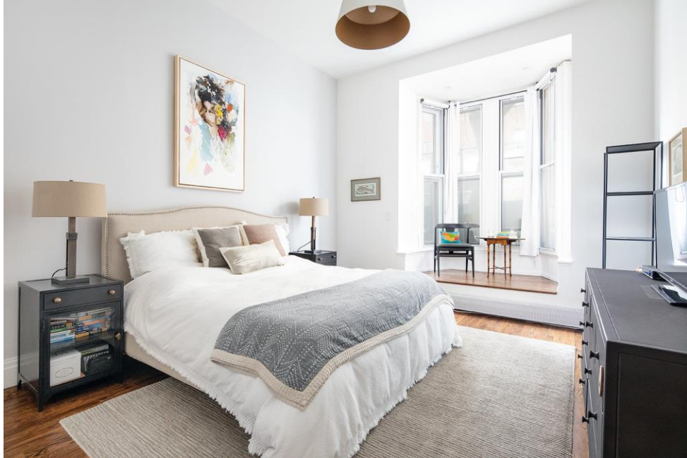
A look at the master bedroom.

The chic master bedroom on the upper level has a bay-window sitting area, as well as a full bathroom with a large, walk-in shower. This room features Carrara marble, a custom vanity with Pietra Cardosa gray stone, and white lacquer cabinetry.