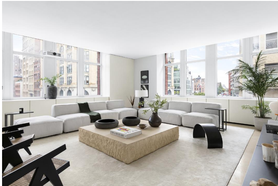
Large picture windows line the corner unit, framing views of SoHo and the New York City skyline.

Located on the fourth floor of a nine-story building in SoHo's landmark district, the home is a tranquil oasis within the bustling Big Apple. Thirteen oversized windows usher in soft, natural light, while also framing picturesque city views to the north and east.