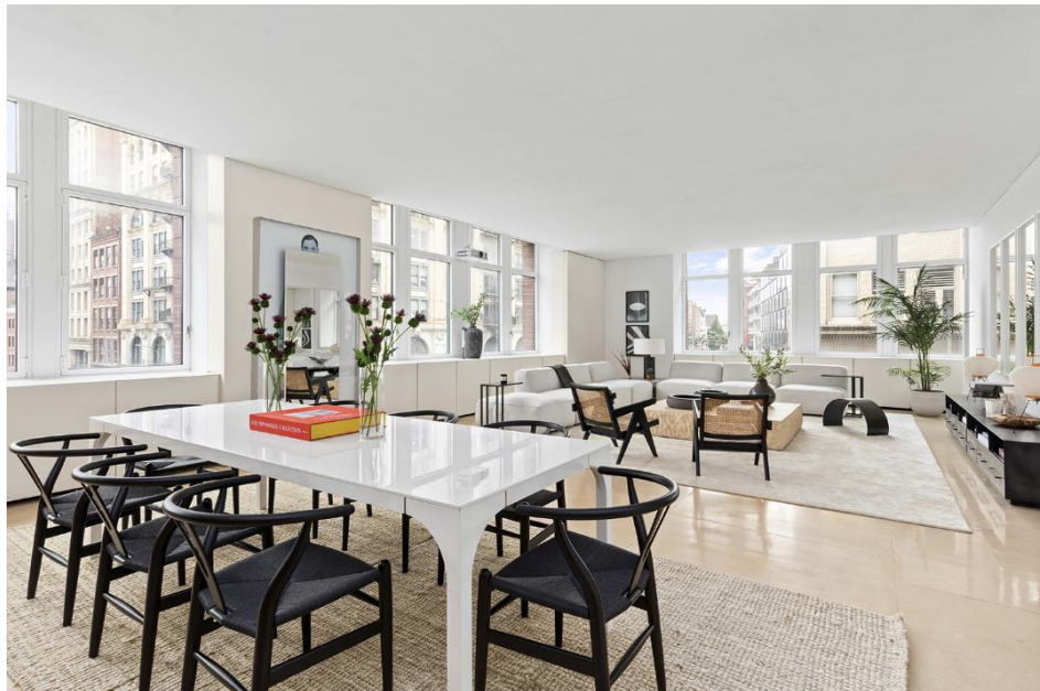
The dining and living areas are located adjacent to the kitchen. With nearly 10-foot-tall ceilings, the space is an open canvas of minimalist decor and wraparound windows.

The home's open kitchen is anchored by a striking stone island. The space features pearwood cabinetry, limestone flooring, Subzero and Miele appliances, and a custom Gaggenau cooktop.