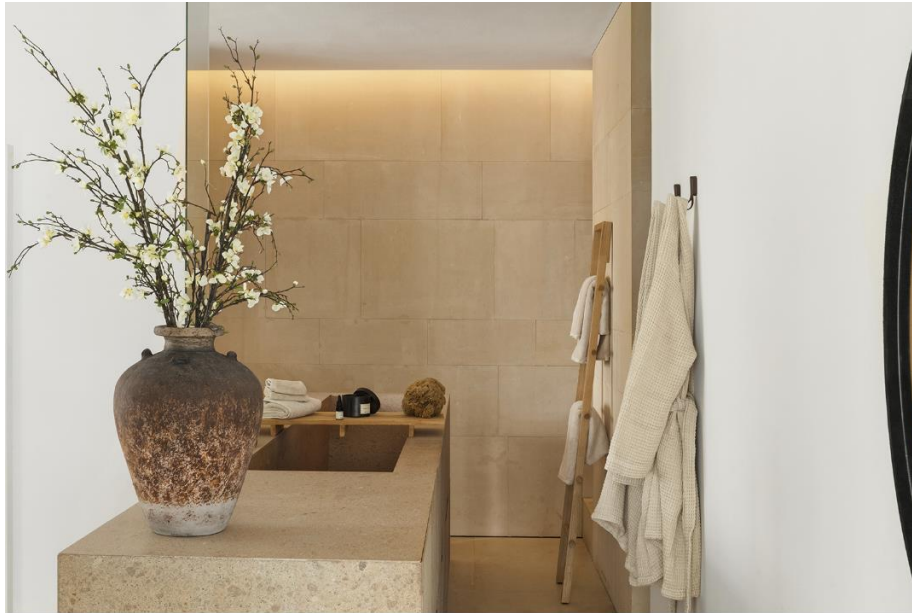
Pocket doors open from the living room directly into a spa-like bathroom.

A second stone island can be found in the master bathroom—the first of several areas in the master suite. Radiant floor heating, custom lighting, and stone-tiled walls set the atmosphere.