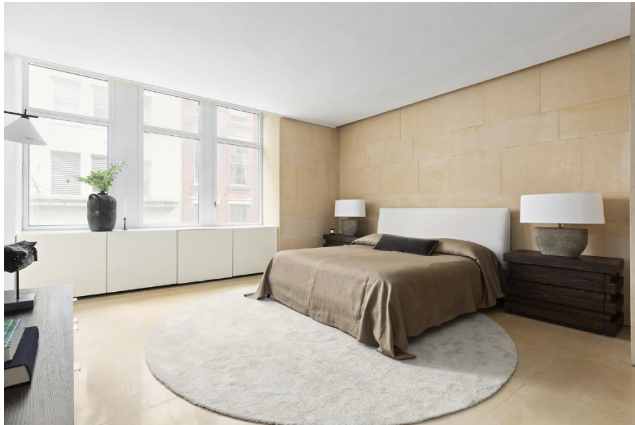
The bathroom opens up to the apartment's only bedroom, which is nestled in a rear corner of the unit. The neutral space is warmly lit from several large windows.

A second stone island can be found in the master bathroom—the first of several areas in the master suite. Radiant floor heating, custom lighting, and stone-tiled walls set the atmosphere.