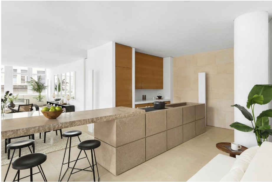
The kitchen is the first space revealed at the end of the hallway. A monolithic stone island anchors the room, complemented by Pearwood cabinetry and French limestone flooring.

The home's open kitchen is anchored by a striking stone island. The space features pearwood cabinetry, limestone flooring, Subzero and Miele appliances, and a custom Gaggenau cooktop.