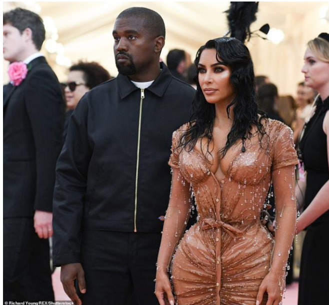
A-list: The couple share four children, North, six, Saint, three, Chicago, one and Psalm, four months (pictured May 2019)