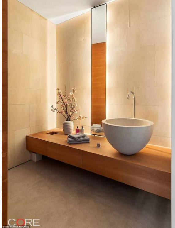
Convenience: It includes a powder room and features a washer and dryer within the unit

Kanye and Kim, 38, currently live in a similarly minimalist mansion in Calabasas, California, though for years they kept its interior design out of the public eye.