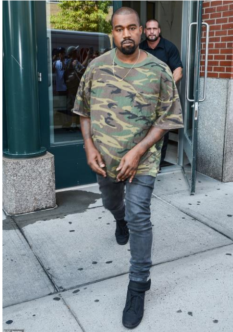
Privacy hawk: Kanye and his wife Kim Kardashian currently live in a similarly minimalist mansion in Calabasas, California, though they didn't share views of the home until Kanye tweeted photos of it in 2018; pictured leaving his old condo in 2015