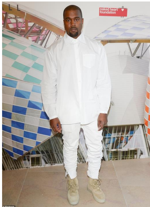
New digs: The Gold Digger hitmaker, 42, invested $3.14m into the mammoth apartment, which he created by combining two units- before offloading the home at a loss of $3m pictured in 2017

In early 2006, he bought a second unit - an 838 square foot studio- for $1.25m, before combining the two into a mammoth one bedroom apartment - and spending $3.14m in total.