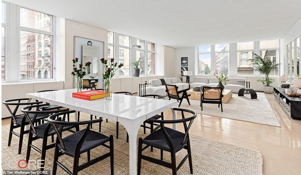
Back again: Kanye West's minimalist chic former Manhattan apartment is back on the market for $4.7m, just one year after the rapper sold the home for $3m