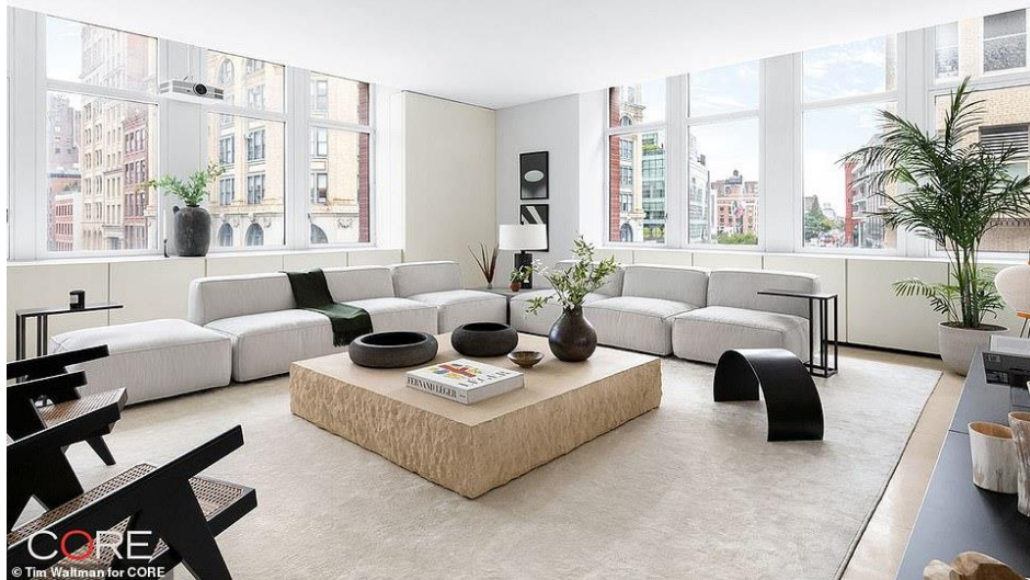
Back-up space: Kanye first snatched up the condo back in 2004 and lived in it on-and-off until last year

The stunning home, listed by Emily Beare of CORE Real Estate, features 10-foot ceilings, custom lighting and audio, heated floors and a spacious master suite.