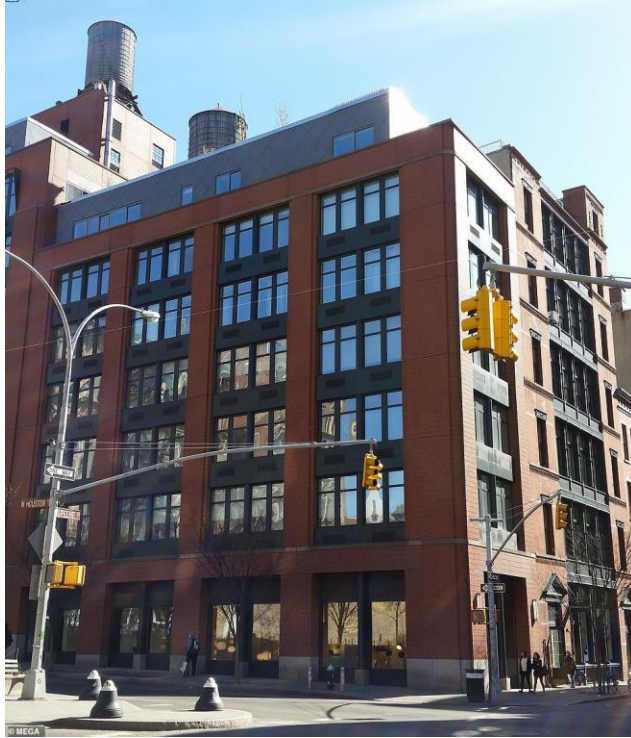
Unassuming look: The exterior of Kanye's former apartment in Manhattan's SoHo neighborhood

While out of the house, their family took up residence with Kim's mother Kris Jenner.