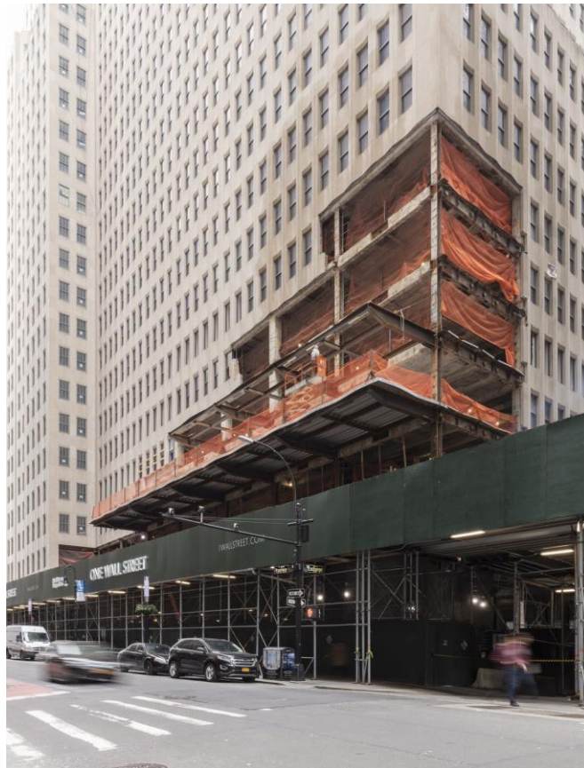
The annex side of the building will have a new, glassy addition.

Once they do, though, potential buyers will get to experience one of the building's most majestic spaces: The Red Room, which once served as the lobby on the landmarked side. The space is not currently landmarked, but Macklowe is restoring it with the assumption that the Landmarks Preservation Commission will seek to protect it once construction wraps. After that, it may be open to the public again.