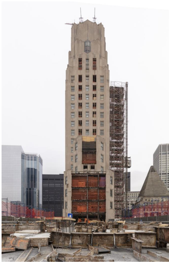
The tower portion, made from Indiana limestone, is largely untouched save for new windows.