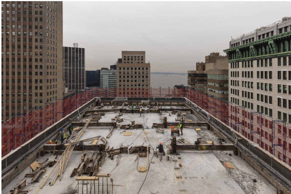
On One Wall Street’s annex, a new addition will have views of New York Harbor and other Financial District buildings.

Once all is said and done, the building will have more than 560 condos, ranging in size from studios to four-bedrooms. Sales are expected to get underway later this year, although